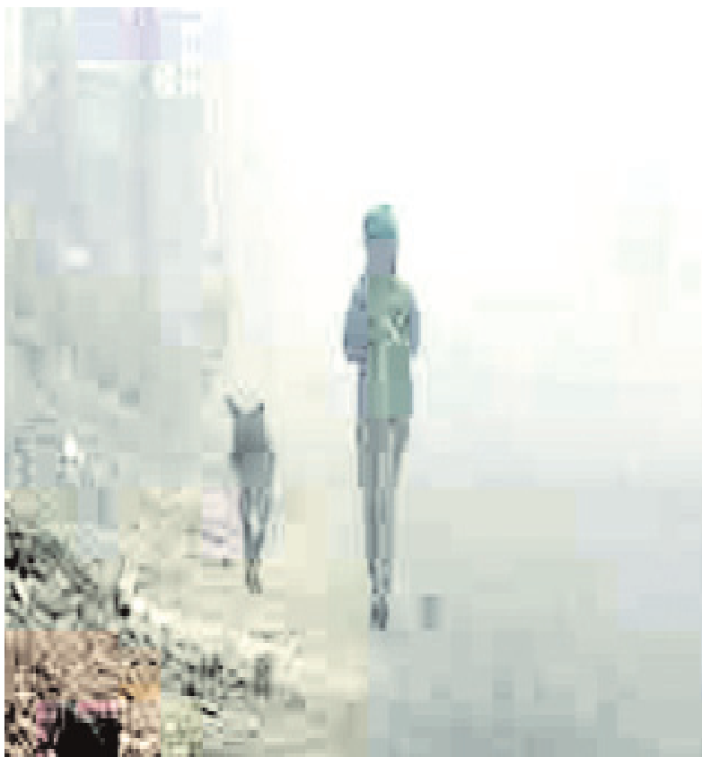
Dewas, Sehore, Shajapur, Dhar, Indore, Ujjain, Rajgarh, Bhopal. The weather will remain changed in the state on December 1.