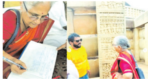
UNESCO World Heritage site Sanchi. In the feedback book she praised the guide and maintenance of the historical monument.