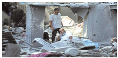
Gaza

At least 160 bodies of Palestinians killed in Israeli strikes were retrieved by rescue teams in the Gaza Strip in the past 24 hours, the Hamas-run Government Media Office (GMO) said. The GMO said that the bodies were recovered from various locations in the besieged coastal enclave, using manual and rudimentary tools, reports Xinhua news agency. Since the ongoing humanitarian pause entered into force on November 24, airstrikes, shelling and ground clashes have largely ceased in Gaza. The office also stated that, since the start of hostilities on October 7, more than 15,000 Palestinians have been killed in Gaza, including about 6,150 children and 4,000 women. The GMO has been reporting casualties since the Ministry of Health in Gaza stopped doing so on November 11, following the collapse of services and communications at hospitals in the north. As reportedly agreed upon by Israel and Hamas, the initial four-day pause has been extended for an additional 48 hours starting on Tuesday. On Tuesday, 10 Israelis and two foreign nationals, held as hostages in Gaza, and 30 Palestinian detainees, held in Israeli prisons, were released. The freed hostages included nine women and one girl. Among the Palestinian detainees were 15 women and 15 boys. Since the start of the pause, 180 Palestinians, 61 Israelis, and 20 foreign nationals have been released. Israel said that the Hamas attack killed about 1,200 people while more than 200 people were taken as hostages.