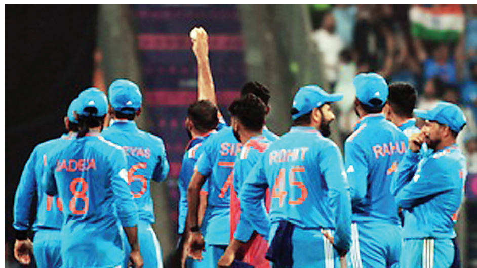
Team Absolute | Mumbai

► First Time In 48 Years! Jasprit Bumrah became the first Indian cricket team bowler to take a wicket on the very first ball of a team innings during a Cricket World Cup match.