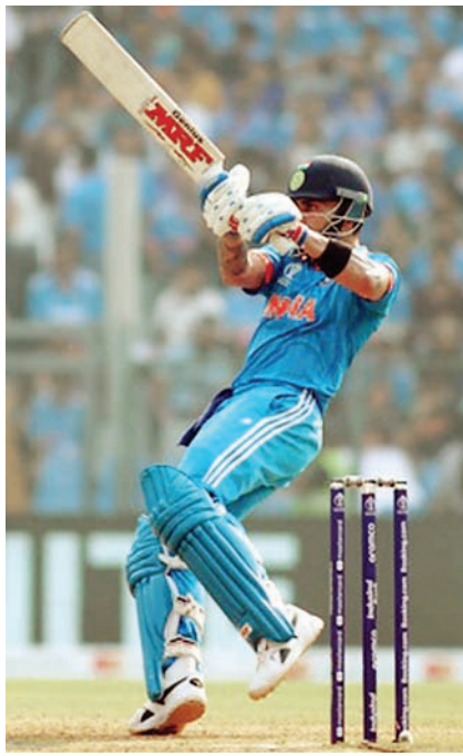
Hundreds heads the record of most ODI Hundreds.

After struggling with the bat in the year 2020, 2021, and 2022 Kohli with 82 runs in the final match against Sri Lanka now becomes the record holder of scoring the most 1000+ ODI runs in a calendar year. Kohli scored a well-compiled 94-ball 88 with 11 fours and no sixes. Kohli now awaits another Tendulkar's record of most ODI Hundreds with 48 under his belt. Tendulkar who has scored 49 ODI