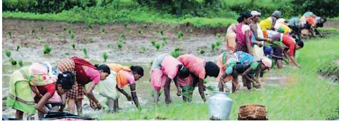
Team Absolute | Mumbai

According to data compiled by the Reserve Bank of India (RBI), in MP, male agricultural workers in rural areas got a daily wage of just Rs 229.2 while in Gujarat, which claims to be a model state, it worked out to Rs 241.9 in the year ended March 2023. The national average for the year was Rs 345.7. As per a calculation by rating firm Crisil, the cost of a vegetarian thali was Rs 27.9 and non-vegetarian thali Rs 61.4 as of September this year. This means a family of five will have to shell out Rs 140 for a veg thali meal or Rs 8,400 per month. While the financial year 2021-22 was bad for the rural economy with the Covid pandemic hitting the jobs and income levels, high inflation and interest rates played havoc in the fiscal 2022-23, hitting the rural demand.