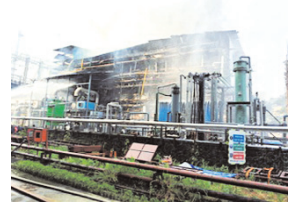
At least four fire engines and police teams along with local volunteers rushed to the spot to battle the blaze and at least five injured victims were brought out.