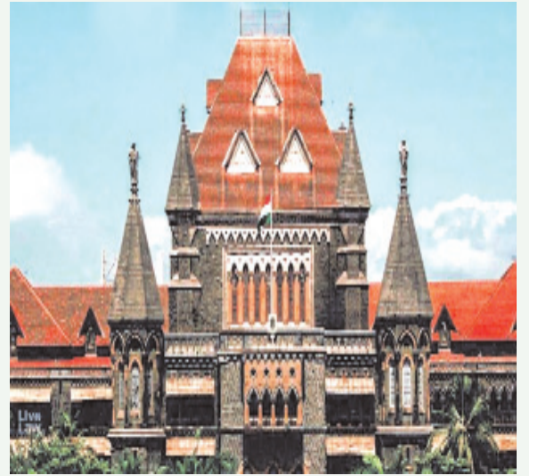
than reconstruction. The Brihanmumbai Municipal Corporation claimed that the reservoir was beyond repair and needed to be reconstructed.