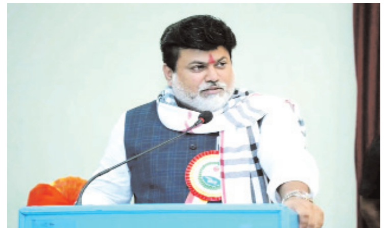
The Maharashtra Industries Minister further said that Chief Minister Eknath Shinde and Deputy Chief Ministers are monitoring these developments.

After Maratha quota activist Manoj Jarange ended his indefinite fast for Maratha quota, Maharashtra Industries Minister Uday Samant on Friday said that the Eknath Shinde-led Maharashtra government is committed to providing reservation to the Maratha community.