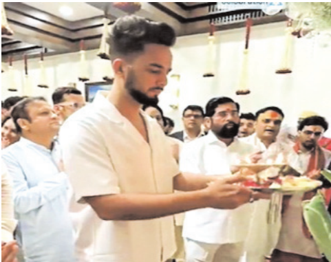
perform a pooja there. Demanding to know whether the CM's official residence 'Varsha' has become a 'tourist hotspot' for junkies...