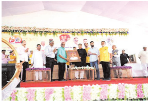
tised and widened at a cost of Rs 600 crore and work will begin next month.