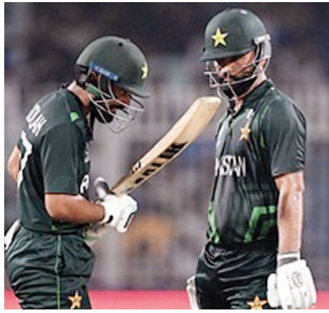
Bangladesh all out for a paltry total of 204.

In the first innings, Shaheen Shah Afridi (3-23), Mohammad Wasim (3-31), and Haris Rauf (2-36) were the pick of Pakistan bowlers, as the pacers rallied together for the Men in Green to bowl