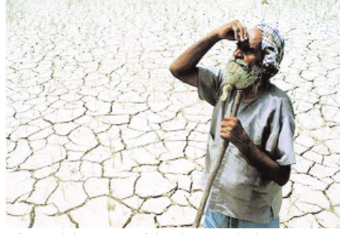
informed the status of the drought declaration in the review of the crop water situation taking into account the provisions of the Drought Management Code, 2016.

The Relief & Rehabilitation Department also