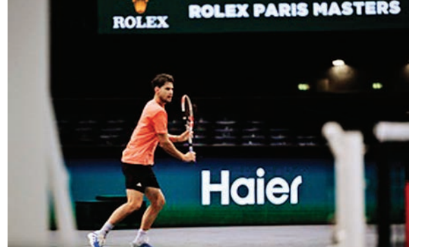
in the match.

While Thiem hit highlight-reel shots throughout the match, especially with jaw-dropping passing shots, it was Wawrinka who was first on the verge of victory. The Swiss held match point at 5-3, 40/30 in the decider, but double-faulted long. It was one of six double faults he hit