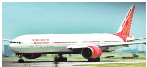
step forward in our ongoing transformation programme, which among other aspects aims at connecting India to more of the world with non-stop flights. We are excited to showcase the positively changing Air India flying experience to travellers on

Tata-owned Air India on Tuesday said that it will operate thrice a week between Mumbai and Melbourne starting December 15, becoming the only non-stop operator between Mumbai and Australia currently. According to the airline, the new Mumbai-Melbourne services will add nearly 40,000 seats per year into the Australian state of Victoria, where the Indian community is estimated at over 200,000, constituting about 40 per cent of the total Indian diaspora in Australia. "We look forward to launching the only non-stop flight between Mumbai and Melbourne. This is a great