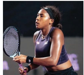
since Wozniacki and the first American teenager to do so since Venus Williams in 1999.

Gauff has now won 50 matches this season, with eight coming against Top 10 opponents. She is the first teenager to win 50 or more matches in a single season since Caroline Wozniacki in 2009. She is also the first teenager to tally a singles victory at the WTA Finals