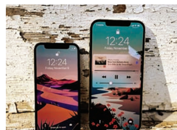
Team Absolute | New Delhi

Several opposition leaders, including Trinamool Congress MP Mahua Moitra, Congress leader Pawan Khera on Tuesday alleged that their mobile phones were being targeted by the Centre.