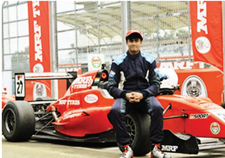
World Finals, also in France.

Later in 2018, he represented India at the X30 World Championship in France, and the next year he took part in the Rotax