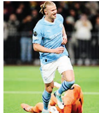
of 2022, Haaland went on to enjoy a stunning inaugural campaign at the Etihad with his goals proving pivotal in the Club's historic Treble campaign.

Having joined City from Borussia Dortmund in the summer