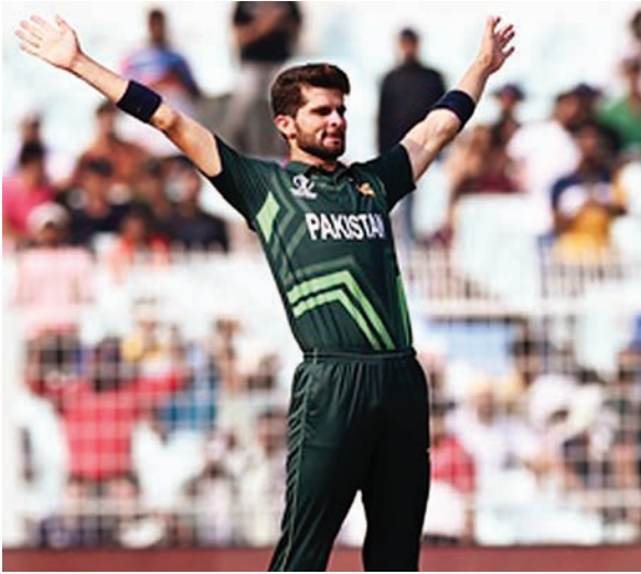
ery swinging back on the pads. In the very next over, he removed Nazmul Hasan Shanto, courtesy of a ripper

The 23-year-old reached the milestone in 51 matches, surpassing Australia's Mitchell Starc's record of 52 ODIs. He also became the fastest Pakistani bowler to reach the milestone of 100 ODI wickets, overtaking the record of Saqlain Mushtaq, who took 53 matches. Afridi trapped Bangladesh lead-batter Tanzid Hasan in front of the wicket with a beautiful in-swinging deliv-