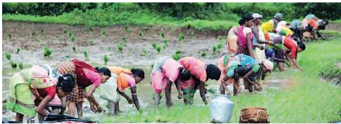
Team Absolute | Mumbai

■ According to data compiled by the Reserve Bank of India (RBI), in MP, male agricultural workers in rural areas got a daily wage of just Rs 229.2 while in Gujarat, which claims to be a model state, it worked out to Rs 241.9 in the year ended March 2023. The national average for the year was Rs 345.7. ■ As per a calculation by rating firm Crisil, the cost of a vegetarian thali was Rs 27.9 and non-vegetarian thali Rs 61.4 as of September this year. This means a family of five will have to shell out Rs 140 for a veg thali meal or Rs 8,400 per month. ■ While the financial year 2021-22 was bad for the rural economy with the Covid pandemic hitting the jobs and income levels, high inflation and interest rates played havoc in the fiscal 2022-23, hitting the rural demand.