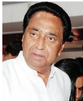
take tough decisions.

The Congress will release its second list of candidates for the November 17 Madhya Pradesh Assembly elections in the next two-three days, former chief minister and state unit head Kamal Nath said here on Monday.