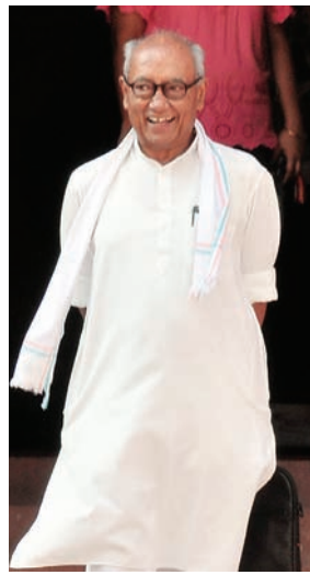
remain in Congress till my last breath."

Days after a fake letter of senior Congress leader Digvijaya Singh announcing his resignation from the party went viral, the former Madhya Pradesh Chief Minister said on Monday that he will stay with the party till his last breath and that the BJP-RSS keep on targeting him.