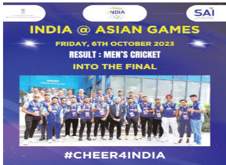
of 14 pushed Bangladesh to a modest 96/9 in 20 overs. The Indian spinners, led by Sai

It took just 9.2 overs for India to chase down 97. Ruturaj Gaikwad set the ball rolling early, offsetting the departure of Yashasvi Jaiswal. Tilak fed off the dominance Gaikwad showcased, and ultimately overtook Gaikwad, registering a 26-ball 55, with his fifty coming off 25 balls and skipper Gaikwad's 40* runs, guided India to victory. India's decision to field first proved astute as Bangladesh struggled to find their footing. Pervez Hossain Emon's painstaking 23 was the highest individual score, while most of the team faltered in single digits. Jaker Ali's resilient unbeaten 24* and Rakibul Hasan's brief cameo