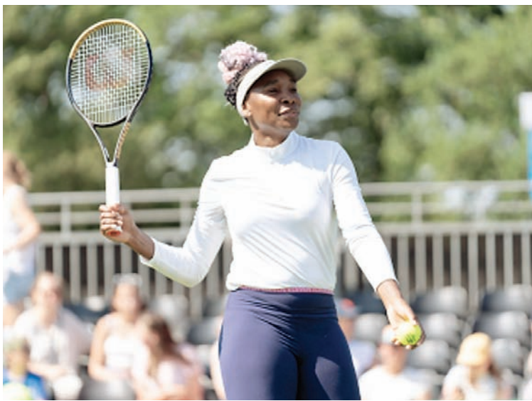
Williams said. Williams played three events after that fateful slip at Wimbledon. She

"I tried my best to recover for the US Open. I did not reach my form so now I am just resting until I get back. I am targeting March, that's when the tournaments go back to the States, so my goal is to be up and running when tournaments come back to the U.S."