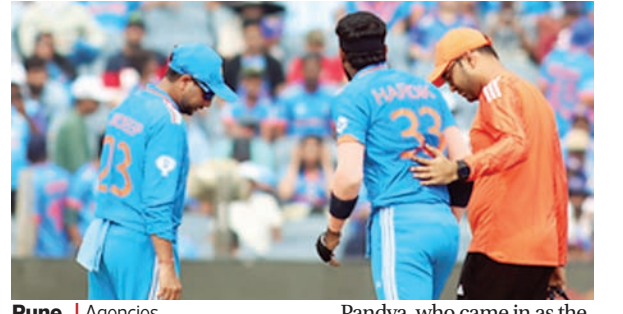
Pune

India all-rounder Hardik Pandya was taken to the hospital for scans after he twisted his ankle and fell heavily in his follow-through before the key allrounder hobbled off after bowling three deliveries in his first over in the match against Bangladesh at the Maharashtra Cricket Association (MCA) Stadium in Pune on Thursday.