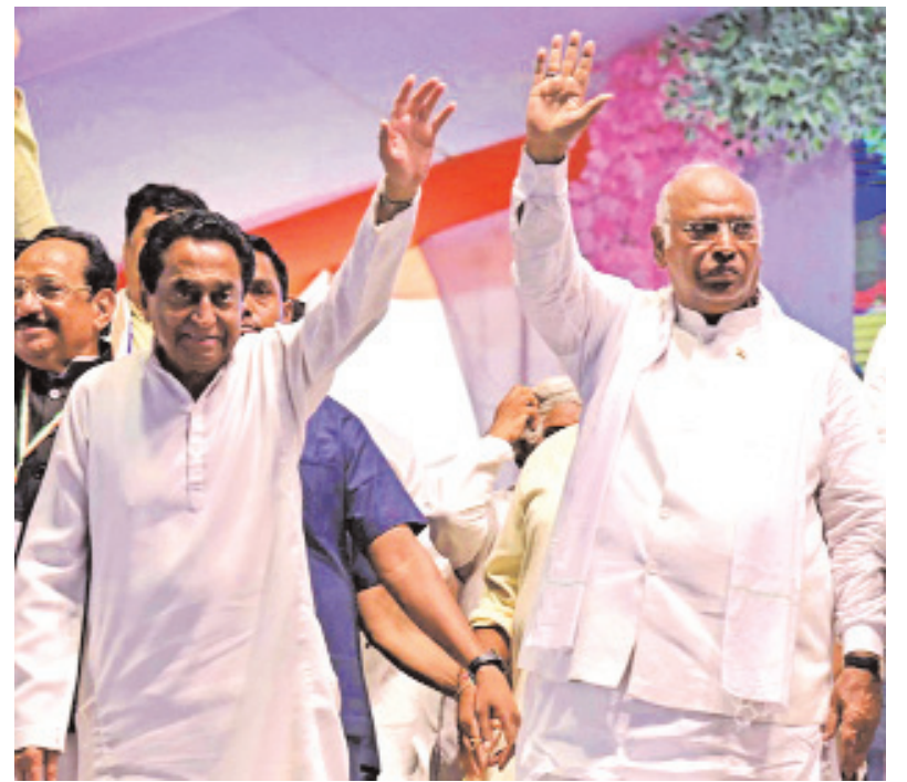
Vijayvargiya from Indore 1.