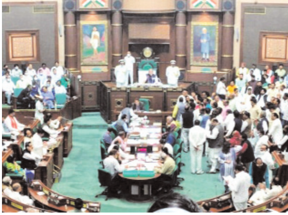
Team Absolute | New Delhi/Bhopal

Out of 230 sitting MLAs in Madhya Pradesh, 186 are crorepaties and 107 out of these MLAs are from the ruling BJP, a report claimed. Association for Democratic Reforms (ADR) and Madhya Pradesh Election Watch analysed the criminal, financial and other background details of all 230 sitting MLAs. The report said that out of 230 sitting MLAs analysed, 186 (81 per cent) are crorepaties. It said that 107 (83 per cent) out of 129 MLAs from BJP, 76 (78 per cent) out of 97 MLAs from Congress and all three independent MLAs have declared assets valued more than Rs one crore. The report said that the average of assets per sitting MLA in Madhya Pradesh is Rs 10.76 crore. It said that the average assets per MLA for 129 BJP MLAs analysed is Rs 9.89 crore, 97 Congress MLAs analysed is Rs 11.98 crore, one BSP MLA analysed is Rs 96.95 lakhs and three Independent MLAs have average assets of Rs 11.98 crores. The report said that BJP's MLA from Vijayraghavgarh Sanjay Satyendra Pathak has declared assets to the tune of Rs 226.17 crore, while Chetanya Kasyap from Ratlam City assembly seat has assets worth 204.6 crore. The report also highlighted that Ram Dangore, a BJP sitting MLA from Pandhna (ST) assembly seat has assets worth Rs 50,749. The report also highlighted that 38 MLAs have declared liabilities of Rs 1 crore and above with Congress Betul MLA Nilay Vinod Daga who has assets worth Rs 127.6 crore has liabilities worth Rs 54 crore. While BJP MLA from Khuraj Bhupendra