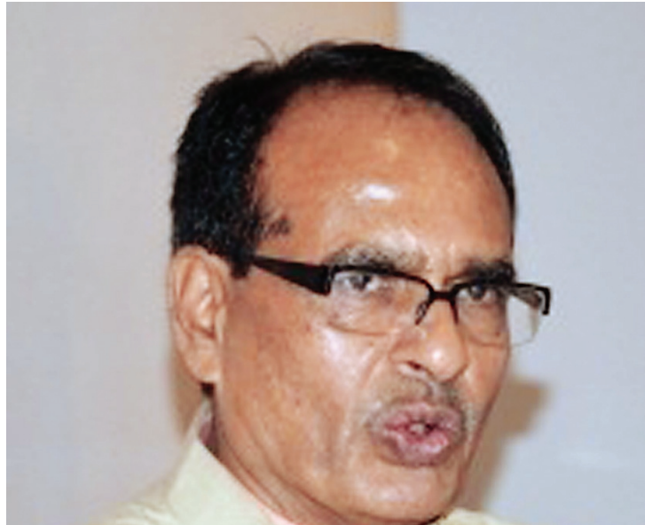
February 28 and the scheme was launched on March 5. On March 20 forms were released and we could release the first installment on June 10. It shows the efforts of the officials." Beside these, he said that his government successfully organised a mega event - 'Janjatiya Gaurav Divas' (Tribal Pride Day - organised on November 15, 2021). "The concept of CM Rise School

"I remember that I took oath as Chief Minister on March 24, 2020 when the second wave of the Covid-19 pandemic was at its peak. Perhaps that was the first time a single man cabinet meeting was held at that time, but we managed to control the situation with the help of officials." During the meeting, he gave a brief introduction of public schemes introduced and the development works taken place under his leadership. Emphasising on 'Ladli Behna Yojana' - a cash scheme for women, which he launched three months back, Chouhan said: "The idea of the scheme came into my mind on