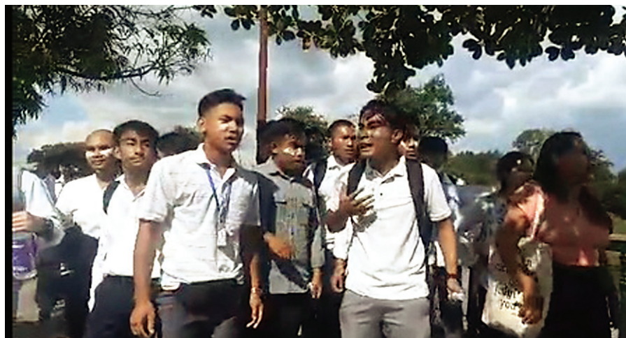
by armed assailants. An official from the Chief Minister's Secretariat said that the Manipur government has handed over the case to the Central Bureau of Investigation (CBI), while the security forces have also initiated a search operation to nab the perpetrators.