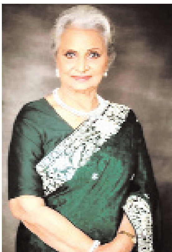
Team Absolute | Mumbai

Veteran actress and dancer Waheeda Rehman, who is known for films like 'Guide', 'Pyaasa', 'Sahib Bibi Aur Ghulam', 'Delhi-6', 'Kaagaz Ke Phool' and several others, is being honoured with the Dadasaheb Phalke Lifetime Achievement Award for her immense contribution to Indian cinema. The actress has played countless memorable characters on the celluloid and is known to be the pillar of Indian cinema with a career spanning almost