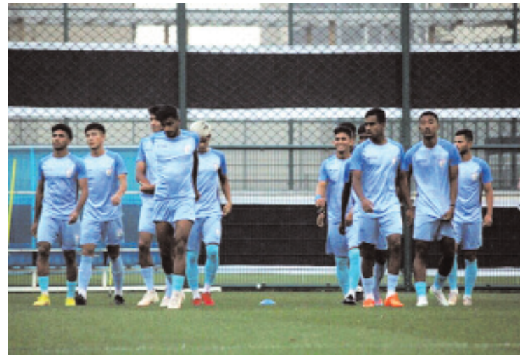
ing session after a defeat. The boys are hurt because of the loss and the manner in which we lost, but their attitude is extremely positive, and they are raring to go again with the same spirit in the next game against

"These are the things that matter the most, especially in the first train-