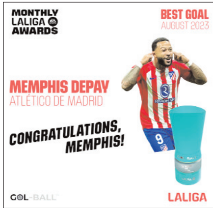
Real Madrid are the outright leaders. Real Madrid's Ancelotti bagged the Coach of the Month award for being the only gaffer to win every game so far to start the season and for his ability to decide matches in the final minutes. Memphis Depay won the Goal of the Month award for his long-range strike against Granada CF in Matchday 1, leading Atlético de Madrid to their first win of the season, a 3-1 victory, at the Estadio Cívitas Metropolitano.

Bellingham claimed the Player of the Month award for his five goals in four rounds and his immediate impact across his first four La Liga games. He is one of the reasons why