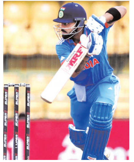
but took only 29 more balls to get to his 47th ODI hundred. Rahul too, meanwhile, completed his ton on his return to international cricket to give India a strong total in Colombo. The Rahul-Kohli stand of 233 runs for the third wicket is also the highest partnership by any Indian pair in the history of the team's participation in the Asia Cup, as the side posted 356/2, also its highest score against Pakistan in ODIs.

Kohli, the No.3 batter, resumed from his score of seven overnight on the reserve day and survived an early review for caught behind off Naseem Shah's over. He looked in pristine touch thereafter, combining with a proactive KL Rahul to build over India's good start on Sunday. Kohli took 55 balls to get to his half-century