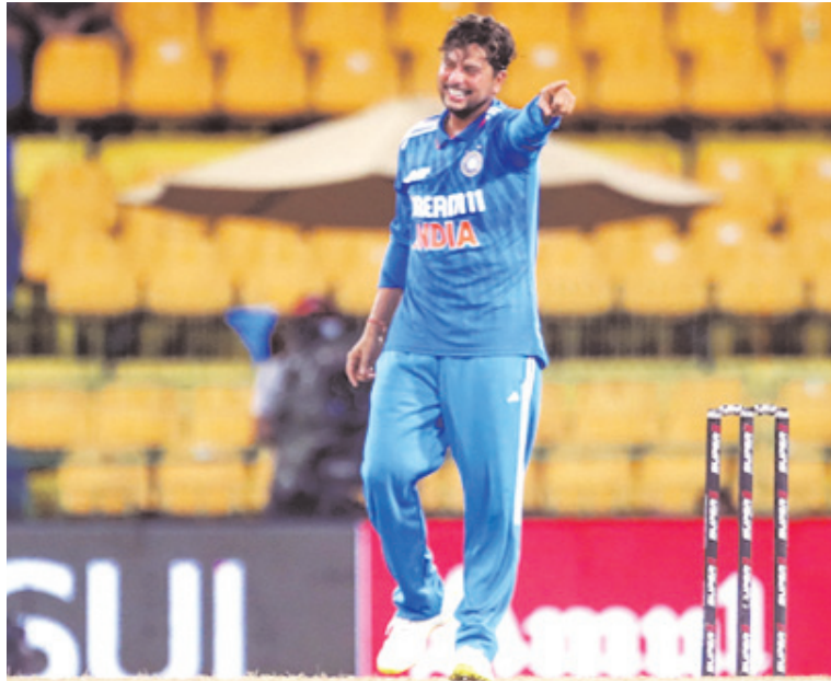
121-run opening stand, then Monday belonged to Rahul and Kohli sharing a huge 233-run stand for the third wicket, also the highest partnership

If Sunday saw Shubman Gill and Rohit Sharma pulverize the Pakistan bowling by hitting quick fifties in a