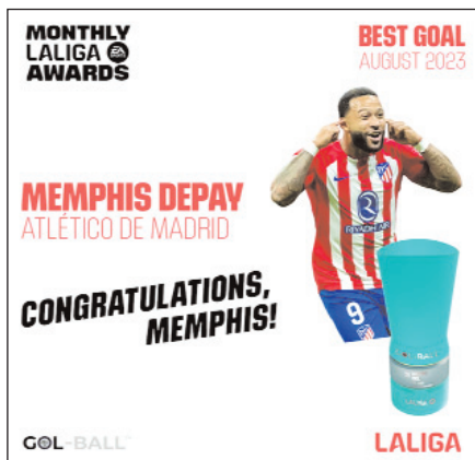
Real Madrid are the outright leaders. Real Madrid's Ancelotti bagged the Coach of the Month award for being the only gaffer to win every game so far to start the season and for his ability to decide matches in the final minutes. Memphis Depay won the Goal of the Month award for his long-range strike against Granada CF in Matchday 1, leading Atlético de Madrid to their first win of the season, a 3-1 victory, at the Estadio Cívitas Metropolitano.

Bellingham claimed the Player of the Month award for his five goals in four rounds and his immediate impact across his first four La Liga games. He is one of the reasons why