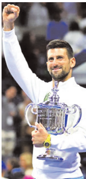
never thought that would be the reality," Djokovic said afterwards. "But the last couple of years, I felt I have a chance, I have a shot for his-

"I never imagined that I would be here standing with you talking about 24 Slams. I