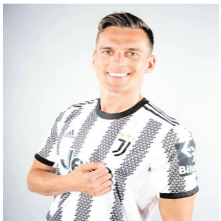
Juventus temporarily climbed to second place with 13 points, one point ahead of AC Milan, who will face Cagliari on Wednesday.

Juventus rebounded from their 4-2 defeat to Sassuolo as Arkadiusz Milik's goal secured a 1-0 victory over 10-man Lecce. Juventus, sitting in fourth with 10 points prior to Tuesday's game, faced an unexpectedly strong Lecce side that had remained unbeaten and occupied third place, reports Xinhua. Juventus controlled the match, crafting multiple opportunities but struggled to score. Their breakthrough came in the 57th minute when Weston McKennie floated a pass to Adrien Rabiot, who headed it down for Milik to tap in at the back post. Late in the game, Lecce's Mohamed Kaba fell in the penalty area under pressure from Federico Chiesa. However, instead of earning a penalty, Kaba received his second yellow card for simulation and was subsequently dismissed. With this victory,