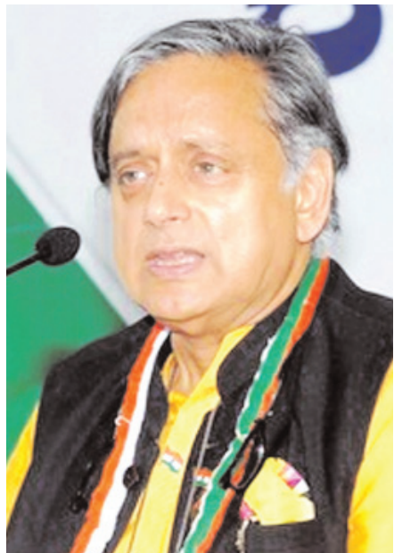
for achieving consensus on the Delhi Declaration.

Congress leader Shashi Tharoor on Sunday criticised the Modi government for not sending an invitation to the opposition for any of the G20 events, including the dinner hosted by President Droupadi Murmu on Saturday, noting no other democracy would snub its own parliamentary colleagues on a global stage like this. "This diplomatic triumph makes it all the more a pity that the government does not bring the same attitude of conciliation and co-operation to bear in its domestic dealings. The failure to invite the Leader of the Opposition (in Rajya Sabha Mallikarjun Kharge), and indeed any Opposition MP, to any of the G20 events, receptions, dinner etc underscores my point. "No other democracy would snub its own Parliamentary colleagues on a global stage like this. A pity that the spirit of accommodation that prevailed at G20 is absent within Indian politics," Tharoor wrote on X (formerly Twitter) referring to the G20 Summit while resharing his earlier post, complimenting India's G20 Sherpa Amitabh Kant