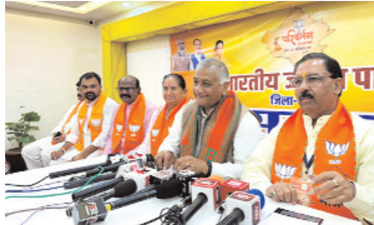
"India has achieved a big victory in the collective manifesto issued in the conference. The world was divided on many issues including Ukraine,

He said that other countries too have praised India for organising such a successful event.