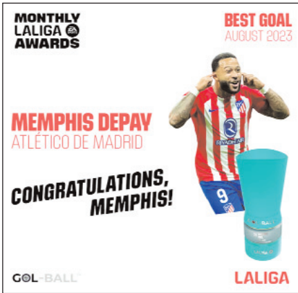
Real Madrid are the outright leaders. Real Madrid's Ancelotti bagged the Coach of the Month award for being the only gaffer to win every game so far to start the season and for his ability to decide matches in the final minutes. Memphis Depay won the Goal of the Month award for his long-range strike against Granada CF in Matchday 1, leading Atlético de Madrid to their first win of the season, a 3-1 victory, at the Estadio Cívitas Metropolitano.

Bellingham claimed the Player of the Month award for his five goals in four rounds and his immediate impact across his first four La Liga games. He is one of the reasons why