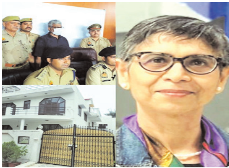
When the police went inside, they found the woman's dead body lying on the bathroom floor. The police called the forensic and dog squad team who inspected the incident site and took into their custody the hard