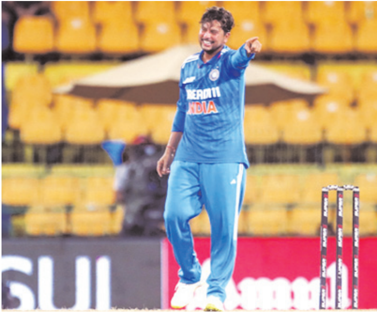
121-run opening stand, then Monday belonged to Rahul and Kohli sharing a huge 233-run stand for the third wicket, also the highest partnership

If Sunday saw Shubman Gill and Rohit Sharma pulverize the Pakistan bowling by hitting quick fifties in a