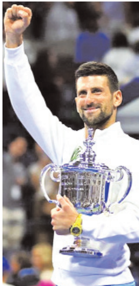
never thought that would be the reality," Djokovic said afterwards. "But the last couple of years, I felt I have a chance, I have a shot for his-

"I never imagined that I would be here standing with you talking about 24 Slams. I