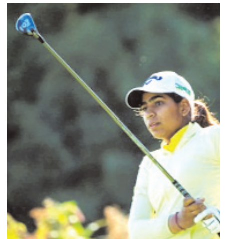
shot. With seven players tied at the top before the final round, it was a close affair. In the 2023 Race to Costa del Sol, the top three players remained the same with Celine Boutier leading followed by Ana Pelaez Trivino in second and Diksha Dagar in third. Cheenglab moved into fourth on 1,317.72 points and extended her lead at the top of the Rookie of the Year standings.