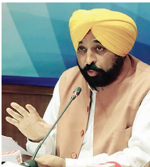
Mann said this state-of-the-art school will act as a catalyst in providing quality education to the students.

He said a budget of Rs 68 crore has been released for setting up these schools and the first school will be dedicated to people on September 13.