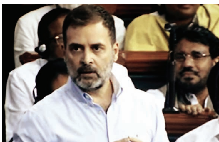
murdered in India. It means Bharat Mata has been killed in Manipur. By