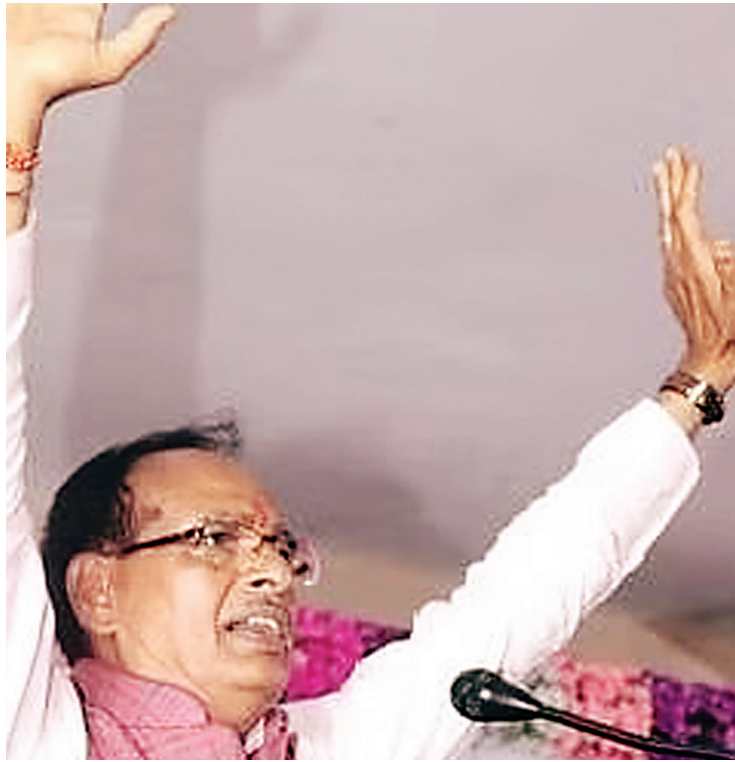
Chouhan will participate in various programs in the district. As per the

Two Day Visit Chouhan will be on a two-day visit to Anuppur district on Wednesday and Thursday. During the stay, Chouhan will participate in various programs in the district. As per the