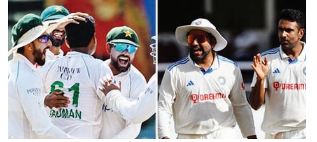
Azam's men dominated the hosts with a thumping innings victory in the second Test. Closely tailing them are India in the second spot with 66.66%, who have a win and a draw against their name after their series against West Indies. India set the tone with a massive innings win in the first Test but rain dampened their hopes of a clean sweep in the second Test that ended in stalemate. Before the sanctions, England and Australia had 26 points each and a point percentage of 43.33. After the penalties, Australia dropped to 30% while England plummeted to 15%,

Pakistan have made a perfect start to the 2023-25 campaign with a point percentage of 100 after their clean sweep against Sri Lanka. After a closely fought first Test, Babar