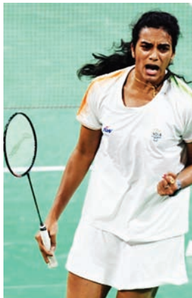
ranked singles shuttler, fended off a challenge from world No. 15 Lee Cheuk Yiu from Hong Kong to win 21-18, 16-21, 21-15. The world No. 9 Indian will next take on Chinese Taipei's Chi Yu Jen.

Meanwhile, the 2021 world championships bronze medallist Lakshya Sen retired mid-way into his first-round match against countryman