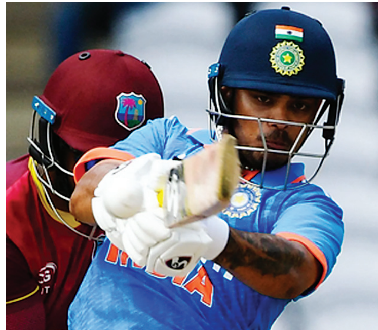
year's ICC Men's Cricket World Cup.

While Kishan has some way to go to match the exploits of the aforementioned quintet, the dynamic 25-year-old has made a blistering start to his international career over the last two years and is in the mix to earn selection for India at this