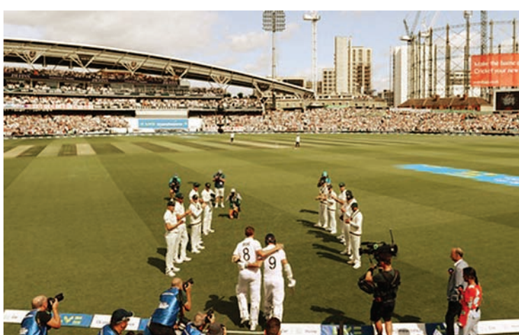
carried on playing but chose not to.

While announcing his retirement, Broad expressed that he could have