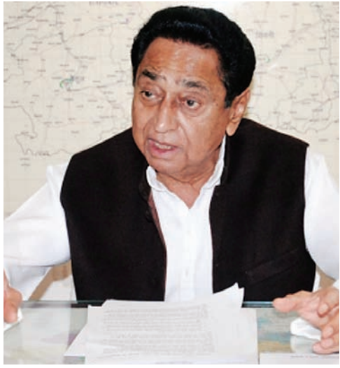
wrote. He further mentioned that Kamal Nath has often presented himself as a devotee of Bajrangbali. "Kamal Nathji, the promise to ban Bajrang Dal in Karnataka Congress' manifesto has hurt the senti-