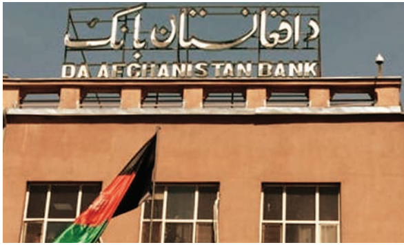
Kabul

Afghanistan's central bank Da Afghanistan Bank (DAB) sold $14 million by auction on Sunday to stabilise the exchange rate of the national currency afghani, the bank said in a statement released here on Sunday.