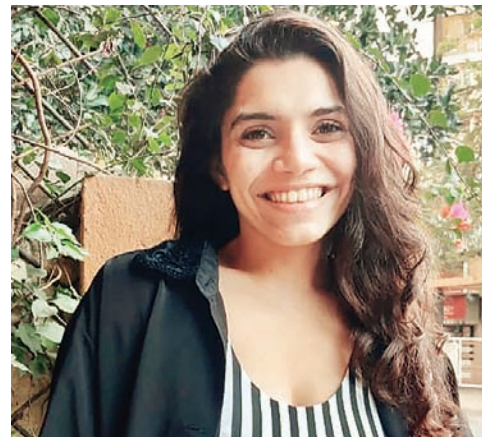
he said. Accordingly, the complainant discussed the offer with her daughter and after meeting the accused person, the schedule of her overseas journey for an "audition" was finalised, said the official.