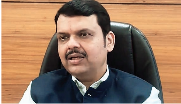
has speculated that Shinde may be upset as the BJP wants him to 'switch roles' with Fadnavis. On the other hand, Shiv Sena's

Nationalist Congress Party's (NCP) national spokesperson Clyde Crasto