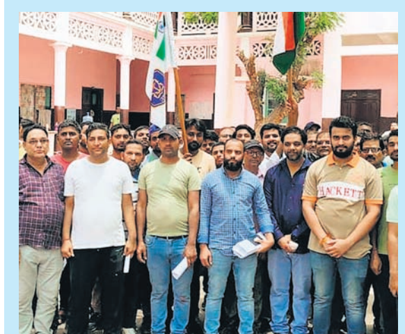
Team Absolute | New Delhi