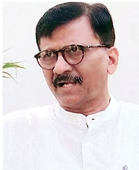
will win 180-185 seats in the Assembly and at least 40 seats in the Lok Sabha polls in Maharashtra. Amid speculations on the unity between MVA

He reiterated his earlier claim that if fresh state elections are held before the general elections next year, the Maha Vikas Aghadi coalition