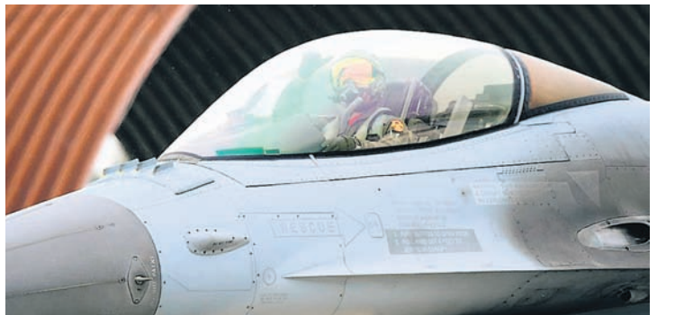
Seoul | Agencies

South Korea and the US kicked off large-scale combined air drills on Monday, the South's Air Force said, amid joint efforts to sharpen deterrence against Pyongyang's military threats. About 110 aircraft and more than 1,400 troops were mobilised for this year's Korea Flying Training (KFT), which got underway earlier in the day for a 12-day run at Gwangju Air Base in Gwangju, 267 km south of Seoul, according to the armed service. More than 60 South Korean warplanes, including F-35A,