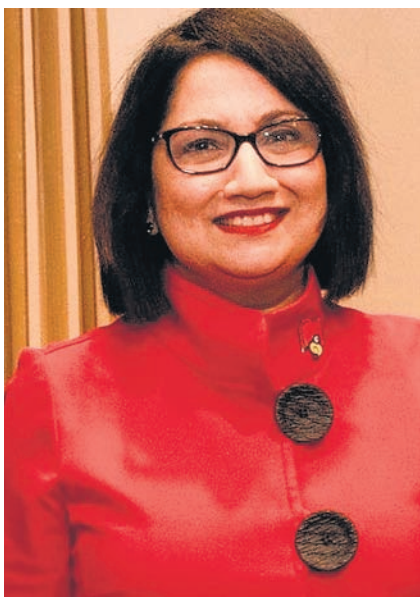
democratic expertise to the forefront to support this impactful collaboration," she said in a statement. AAU created the national task force in