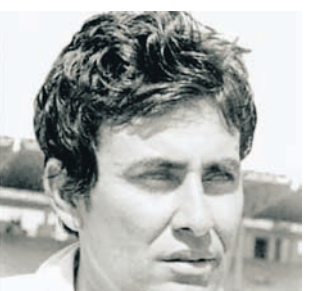
a family friend in Mumbai. A slow left-arm orthodox bowler and left-handed batsman, Durani was the hero of India's series victory against England in 1961-62, claiming 8 and 10 wickets in India's Tests, respectively. He also played a key role in India's maiden Test win against the West Indies in 1972, taking the wicket of key batters Clive Lloyd and Gary Sobers. He is the first cricketer to receive the prestigious Arjuna Award and was awarded the C.K. Nayudu Lifetime Achievement Award by the BCCI in 2011. In 29 Tests, Durani scored 1202 runs at an average of 25.04 hitting one century and seven half-centuries. In his 50 innings, Durani scalped 74 victims at an average of

Salim Durani, one of the finest all-rounders that have played for India, passed away at his home here after a prolonged battle with cancer, on Sunday. He was 88, according to a family source. Born in Kabul, Afghanistan, Durani had Pashtun origins and was known for his batting and bowling prowess that left the spectators thrilled. "He will always be remembered for hitting sixes when spectators demanded. Hitting sixes during that period was rare," remembered