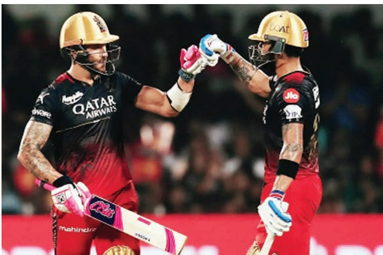
Bengaluru

Scintillating half-centuries from Faf du Plessis and Virat Kohli powered Royal Challengers Bangalore (RCB) to a thumping eight-wicket victory over Mumbai Indians in an IPL 2023 match, marking a happy homecoming at the M Chinnaswamy Stadium, here on Sunday. As RCB took the field in Chinnaswamy Stadium after 1247 days, chants of the franchise engulfed the whole arena. To their credit, RCB didn't disappoint at all, as bowlers got wickets in power-play and middle overs to keep Mumbai to 171/7, though young Tilak Varma shined with an outstanding 84 not out off just 46 balls. In reply, du Plessis and Kohli put out an exhibition of majestic stroke-play and rattled Mumbai's bowling attack to enthrall home fans. While du Plessis made 73 off 43 balls, including five fours and six sixes, Kohli was in sublime touch to be 82 not out off 49 balls, laced with six fours and five sixes