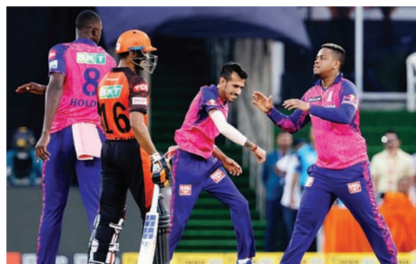
Hyderabad

An impressive batting display from top-order batters followed by Yuzvendra Chahal's superb four-fer (4/17) lead Rajasthan Royals to a resounding 72-run victory over Sunrisers Hyderabad (SRH) in the fourth match of the IPL 2023 at Rajiv Gandhi International Stadium on Sunday. Riding on the half-centuries from Jos Buttler, Yashasvi Jaiswal and Sanju Samson, RR posted a massive total of 203/5 on the board. In response, SRH suffered early batting collapse as they managed to score 131/8 in their 20 overs with Abdul Samad top scoring with 32 runs. Chasing a big total of 204, Sunrisers got early blows as Trent Boult dismissed opener Abhishek Sharma and Rahul Tripathi for ducks. Harry Brook and Mayank Agarwal cautiously took the innings forward with RR bowlers keeping a tight leash and managed to score 30 for a loss of two wickets in the powerplay. In the first over after pow-