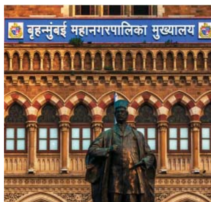
roads, bridges, and rainwater channels for proper planning and