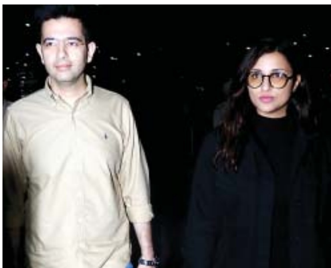
series 'Citadel', will be in India during the last week of October to attend the 23rd edition of the Jio Mami Film Festival. Meanwhile, on the work front, Parineeti will be seen sharing the screen with Diljit Dosanjh in the Imtiaz Ali directorial 'Chamkila'. The film is said to be inspired by Punjabi singer Amar Singh Chamkila.

Team Absolute | Mumbai Bollywood actress Parineeti Chopra had earlier sparked dating rumours with AAP leader Raghav Chadha with her outings. However, their wedding already seems to be on the cards as the couple took the first step towards the union. Recently, Parineeti was seen wearing a silver band on her ring finger. As per media reports, Parineeti and Raghav got engaged in a traditional roka ceremony in the presence of close family members. The two will reportedly get married by the end of October this year.