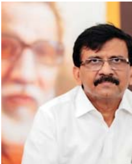
real number of fatalities, Raut said, "If you look at the total figure from all the villages (from the talukas in Raigad) then minimum 50 and maximum 75 people have died. 'Khoke sarkar' (a term the Uddhav Thackeray-led Shiv Sena uses to mock the Eknath Shinde-led gov-

Team Absolute | Mumbai Even as the death toll due to sunstroke at an award function in Navi Mumbai stood at 14 so far as per the official figures, Shiv Sena (UBT) leader Sanjay Raut on Thursday claimed that 50 to 75 people have died in the tragedy, and accused the Maharashtra government of hiding the real number of the deceased. Talking to reporters, Raut said he interacted with the workers of his party from Uran, Shrivardhan, Roha and Mangaon talukas in Raigad district, who told him that the actual number of the people who died at Kharghar is bigger than what the government has announced. Officials have said that 14 people died after suffering from sunstroke during the Maharashtra Bhushan award ceremony held in Kharghar area of Raigad district neighbouring Mumbai on Sunday. The function was held in an open ground and was attended by several lakh people, most of them followers of social worker Appasaheb Dharmadhikari, who was conferred with the Maharashtra Bhushan award by Union Home Minister Amit Shah at the event. Accusing the state government of hiding the