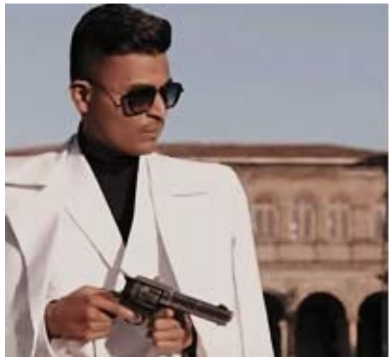
cal circles, with even the SPPU officials condemning it and later lodging a police complaint. Pawar said that the shooting showed the singer sitting in the chair of the Vice Chancellor, displaying liquor bottles on a table before him and reeling off abusive and objectionable lyrics - with clips going viral on