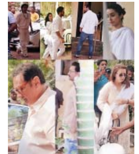
'Fanaa', 'Mardaani', 'Ladies vs Ricky Bahl' and 'Rab Ne Bana Di Jodi'. Pamela Chopra had been admitted to Mumbai's Lilavati Hospital two weeks ago due to an age-related illness. She was reportedly put on a ventilator by the doctors, but her health deteriorated.