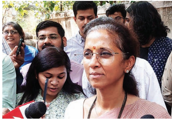
fication of the 16 Shiv Sena MLAs, including NCP chief Sharad Pawar, and secondly its potential ramifications on the state government here.

A party leader here explained that her possible references could be firstly to the upcoming Supreme Court verdict on the disquali-