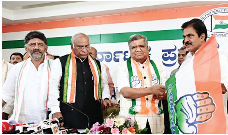
Bengaluru

Karnataka Congress chief D.K. Shivakumar said on Tuesday that with former Chief Minister Jagadish Shettar and ex-Deputy CM Lakshman Savadi joining, the party would win 150 seats in the upcoming Assembly elections. Speaking to reporters Shivakumar stated that with this development the voters of Veerashaiva and Lingayat community will go with the Congress. "Our survey projected 141 seats. Now, with the joining of Shettar and Savadi we will reach 150," he said. "After the arrival of these two leaders, the vote share of Congress in Lingayat community has increased by two to three per cent. I am