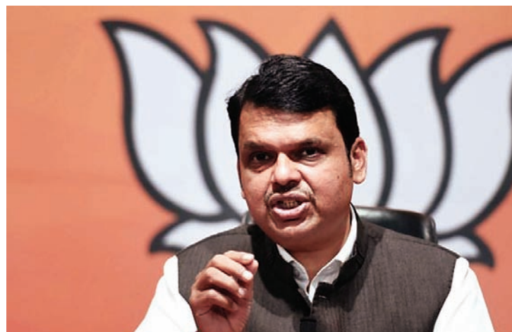
far more dangerous crime than murder, the deputy CM added.

"Human trafficking is a very big challenge before us. It is said that drugs trade is the biggest trade in the world but unfortunately human trafficking is to some extent, along with drugs trade, becoming a big trade. Women and children are most vulnerable to it," he said. Its victims suffer a lot, and it is a