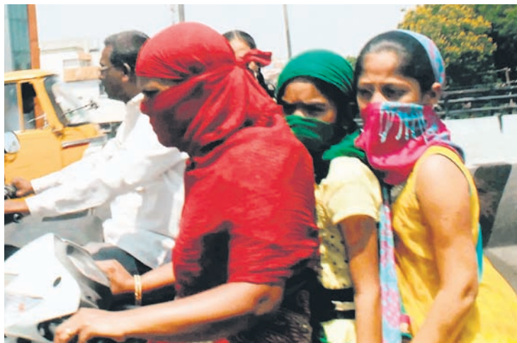
University of Hyderabad (UoH) has established.

The team found that days with anomalously higher temperatures are increasing during summer every year while the days with anomalously lower temperatures are decreasing during winter every year. The occurrence of anomalously higher temperatures for consecutive three days or more is referred to as a heat wave event.