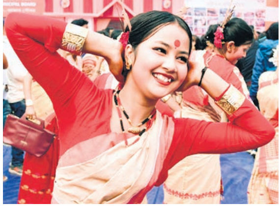
Team Absolute | Agartala

Braving the rising temperatures across the northeastern states, people in the region on Saturday celebrated Rongali Bihu and Poila Boishakh with rituals, traditional fervour and enthusiasm. Lakhs of people including women and children in traditional and new attires took part in the celebrations, especially in the states of Assam and Tripura. "The record-breaking Bihu performance was aimed to take the famous indigenous cultures to the world arena," Assam Chief Minister Himanta Biswa Sarma had told the enormous gathering. Cutting across religious barriers and economic status, people also exchange various sweets and gifts, including the traditional 'Gamosa' (a white piece of cloth with a red border having a customary pattern), with their near and dear ones as a mark of love and New Year celebrations.