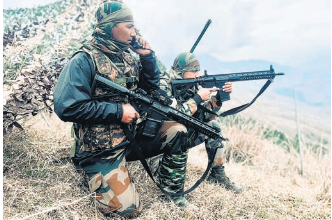
Team Absolute Kolkata

n less than a month after Ex Vayu Prahar close to the Line of Actual Control (LAC) in the Eastern Theatre, the Indian Army and Indian Air Force (IAF) conducted vet another tactical drill in the first week of April to validate multi-mode insertion of strategic forces along the Frontier.