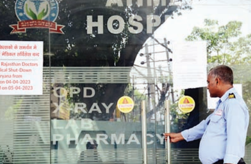
Cyber City Gurugram to protest against the Rajasthan government's Right to Health Bill. "There is a provision in the Right to Health Bill like giving treatment to the patient without charging in an emergency. Due to this, the doctors will not only have to face loss, but the cases of quarrels in the hospital will also increase. The Rajasthan gov-

Gurugram | Agencies A group of doctors from Indian Medical Association (IMA) Gurugram, carried out a protest in the city on Tuesday against the Right to Health Bill which was passed by the Rajasthan assembly last week. IMA Gurugram has also extended support to the doctors of Rajasthan in protest against the Bill. To observe the protest, all types of private medical services remained closed in the entire Haryana on Tuesday. More than 500 doctors staged a protest against the Rajasthan government's decision. On Tuesday, doctors in Gurugram observed a 24-hour strike across Haryana. Hundreds of doctors took to the streets in