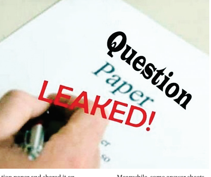
tion paper and shared it on WhatsApp. The education department suspended four others who were on duty at the exam centre. Meanwhile, some answer sheets of the first paper went missing in Adilabad district's Utnoor town. Police registered a case and took up

Hyderabad | Agencies For a second consecutive day on Tuesday, Telangana witnessed leakage of question papers of 10th class exams. Hindi question paper of Second School Certificate (SSC) was allegedly circulated on some WhatsApp groups in Warangal district on Tuesday. Minutes after the Hindi exam started, the paper was circulated on social media. Education minister P. Sabita Indra Reddy has taken serious note of the reports and directed the district education officers of Warangal and Hanamkonda to lodge complaints with the police. The DEOs denied the reports of paper leak. This comes a day after Telugu paper was circulated on WhatsApp group in Vikarabad district. Two teachers were arrested by the police for leaking the paper from an examination centre in Tandur. One of the teachers, who was on invigilation duty at the exam centre, allegedly took a photo of the ques-