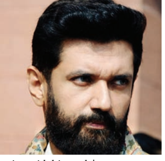
ration with his uncle's party Rashtriya Lok Janshakti Party (RLJP), Chirag Paswan said that it is not possible in this life. Chirag Paswan, Pasupati Kumar Paras and Upendra Kushwaha are openly supporting BJP. They were expecting alliance with BJP in the 2024 Lok Sabha election. But, after the announcement of Amit Shah, it would be a big jolt to these three leaders. Amit Shah, during the

Patna | Agencies After Union Home Minister Amit Shah claimed that his party will contest all 40 Lok Sabha seats of Bihar in 2024, Lok Janshakti Party Ram Vilas (LJP) hinted that his party will also contest on all 40 seats. You know that we recently went to Biharsharif Nalanda to strengthen our party and I am going to Mokama today. So we are also preparing to contest all seats of Bihar." "You know that LJP has a party structure in all Lok Sabha constituencies of Bihar and they are working well," he said. When asked about the collabo-