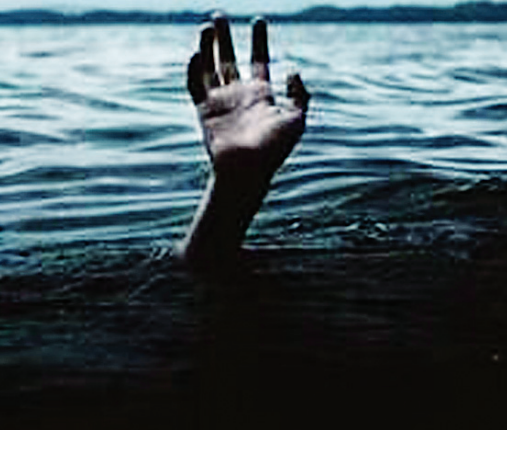
conducted and the exact cause will be ascertained after that." "A very tragic incident occurred today, in which we lost three of our young children. Assistance from the