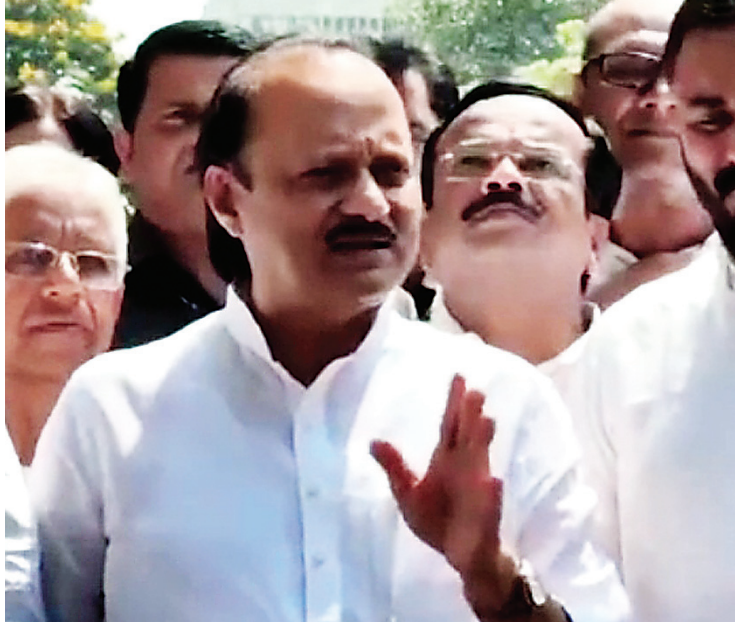
upheavals" expected to rock the state politics in the next few days, and further fuelled by media speculation.

His statement came after some leaders of the ruling Shiv Sena and BJP dropped hints over the past few days over certain major "political