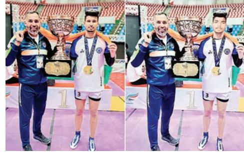
native village Rusa as the sitting MLA wanted to be a part of the celebrations.