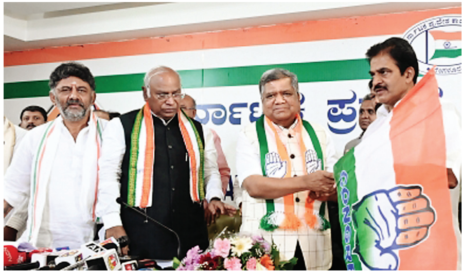
Bengaluru | Agencies

K arnataka Congress chief D.K. Shivakumar said on Tuesday that with former Chief Minister Jagadish Shettar and ex-Deputy CM Lakshman Savadi joining, the party would win 150 seats in the upcoming Assembly elections.