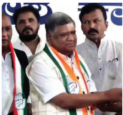
BJP. He could have been made a Rajya Sabha member... to get him ticket, I was humiliated and