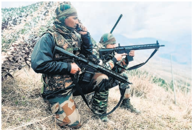
Team Absolute | Kolkata

In less than a month after Ex Vayu Prahar close to the Line of Actual Control (LAC) in the Eastern Theatre, the Indian Army and Indian Air Force (IAF) conducted yet another tactical drill in the first week of April to validate multi-mode insertion of strategic forces along the Frontier. China has not only created military infrastructure on its territory close to the LAC but has also renamed certain parts of Arunachal Pradesh which it claims as southern Tibet. India has diplomatically rubbished this attempt by China to rename locations in Arunachal but the mili-