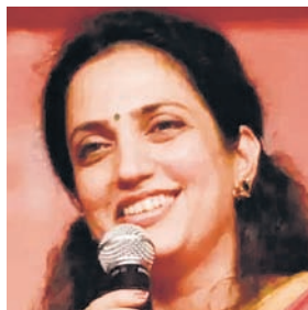
President Chandrashekar Bawankule reacted sharply to the development saying that since the party (Sena-UBT) is being decimated, it has to rely on other family members to keep it going.