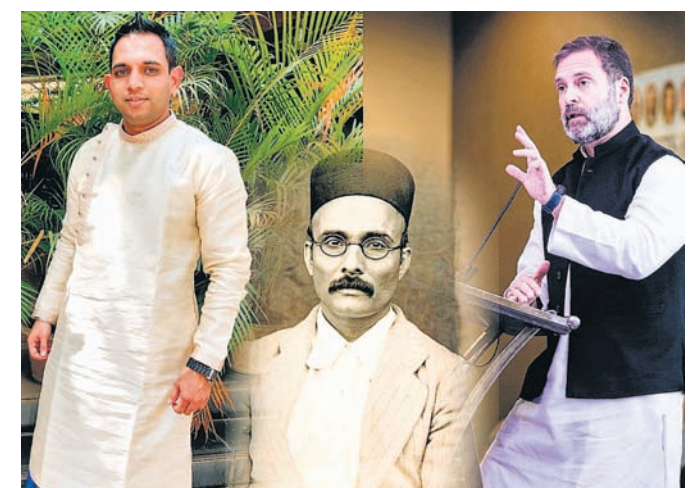
ing that VD Savarkar had written a book in which the latter stated that he and his five to six friends were beating a Muslim man and he (Savarkar) felt happy.

Late Hindutva ideologue VD Savarkar's grandson on Wednesday approached a court here in Maharashtra with a criminal defamation complaint against Congress leader Rahul Gandhi accusing him of making false allegations against Savarkar during his address in London.