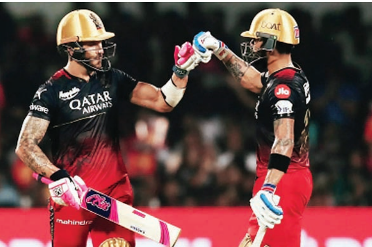
Bengaluru

Scintillating half-centuries from Faf du Plessis and Virat Kohli powered Royal Challengers Bangalore (RCB) to a thumping eight-wicket victory over Mumbai Indians in an IPL 2023 match, marking a happy homecoming at the M Chinnaswamy Stadium, here on Sunday. As RCB took the field in Chinnaswamy Stadium after 1247 days, chants of the franchise engulfed the whole arena. To their credit, RCB didn't disappoint at all, as bowlers got wickets in power-play and middle overs to keep Mumbai to 171/7, though young Tilak Varma shined with an outstanding 84 not out off just 46 balls. In reply, du Plessis and Kohli put out an exhibition of majestic stroke-play and rattled Mumbai's bowling attack to enthrall home fans. While du Plessis made 73 off 43 balls, including five fours and six sixes, Kohli was in sublime touch to be 82 not out off 49 balls, laced with six fours and five sixes