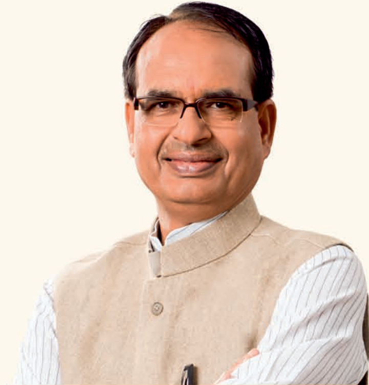
शिवराज सिंह चौहान, मुख्यमंत्री