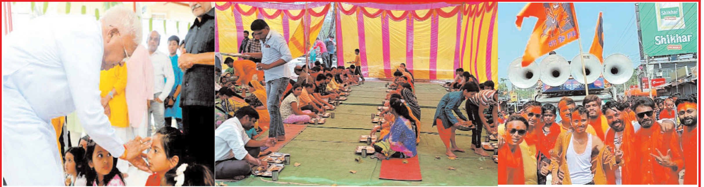
Governor Mangubhai Patel offered prayers at the temple on Ram Navmi, and performed Kanya-Pujan. People of the town visited temples, offered prayers and participated in the procession of the Shobha Yatras. Chief Minister Chouhan offered prayers and wished for the prosperity of the people of the state.