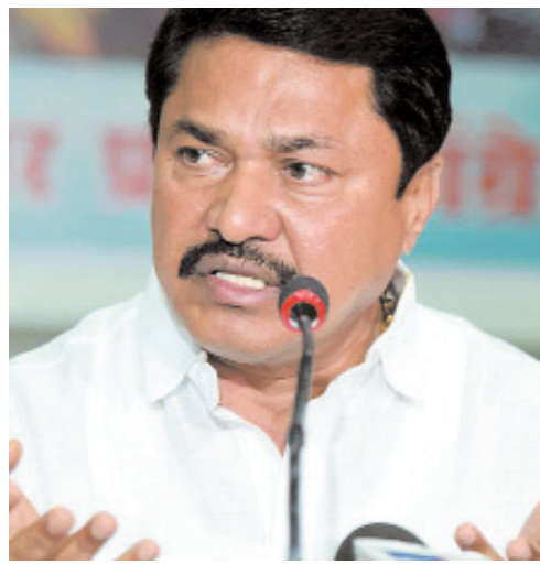
law and order has totally collapsed and the MPs and MLAs of the ruling Shiv Sena-Bharatiya Janata Party openly bully the people and the Opposition leaders.

Endorsing the SC's ire, he alleged that the state's