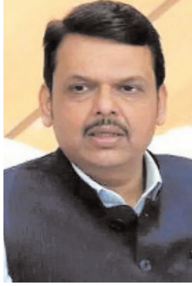
Thursday, police officials said.

A mob of more than 500 people allegedly attacked policemen on Wednesday night after some youth clashed among themselves. The incident, which lasted around an hour, took place in Kiradpura locality, which has a famous Ram temple where a huge crowd is expected to celebrate the Ram Navami on