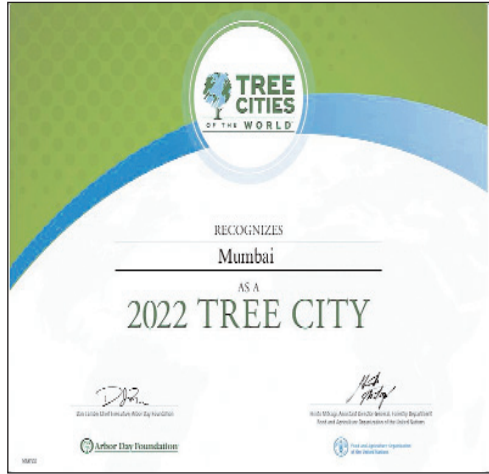
award like determining responsibilities for tree

Mumbai fulfilled the five ADF criteria for the