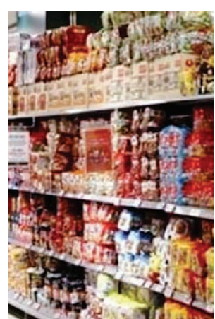
figure. South Korea was the world's second-largest exporter of noodles last year following China that sold 460,000 tons of the products, the data showed. The brisk shipment was

S outh Korea's exports of instant noodles reached an all-time high in 2022, boosted by the global popularity of Korean food and culture, data showed on Thursday. The country exported $862 million worth of noodles, including instant noodles, or "ramyeon" in Korean, and udon noodles, last year, up 12 per cent from a year earlier, according to the data from the Korea Customs Service. It marked the highest ever global sales for South Korean noodles, surpassing the previous record set in 2021, reports Yonhap News Agency. By volume, outbound shipment of noodles grew 10.3 per cent on-year to 260,000 tonnes in 2022, also a record