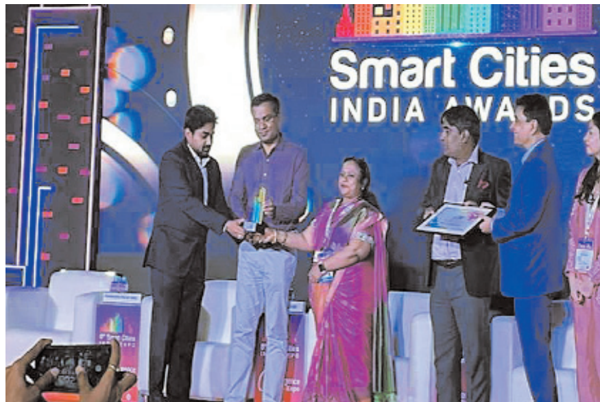
City Leader (Best Smart City CEO) category. Similarly, Smart City Bhopal has received a special award for Smart Parking Category, Sagar for Clean City Category