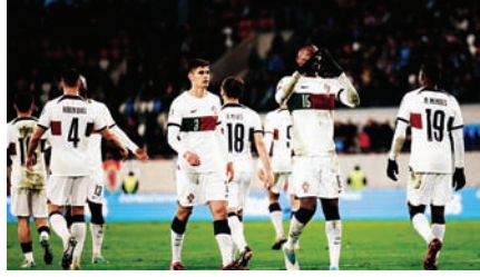
London | Agencies

England saw off Ukraine 2-0 to make it two wins from two, while Portugal thrashed Luxembourg 6-0 to take back-to-back wins in Euro 2024 qualifiers.