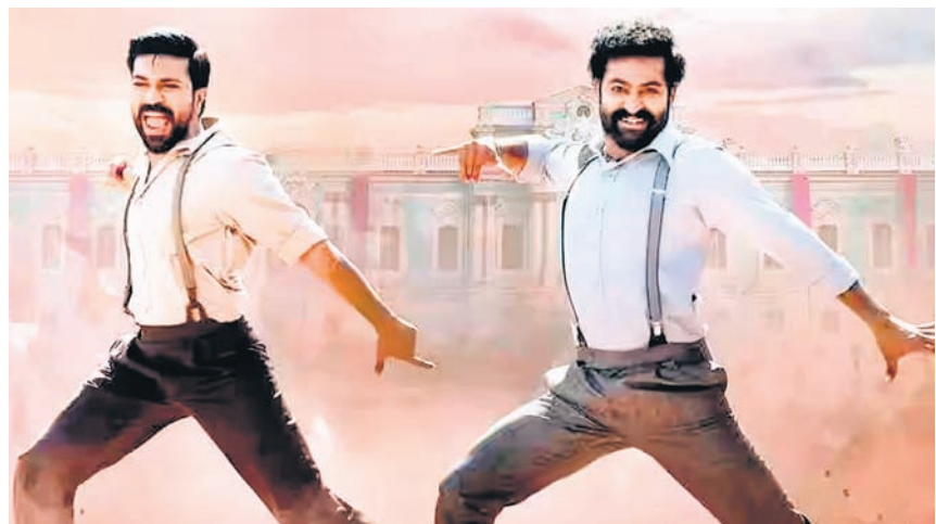
LOS ANGELES

'Naatu Naatu' picturised on Ram Charan and NTR Jr from the film 'RRR' made India proud again as it won the Best Original Song at the 95th Academy Awards.