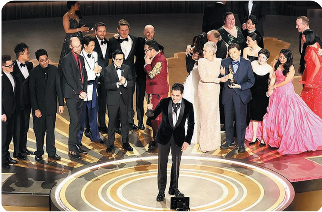
Los Angeles

'Everything Everywhere All at Once' was named best picture at the 95th Academy Awards, capping off an improbable awards season run by winning the movie business's highest honour.