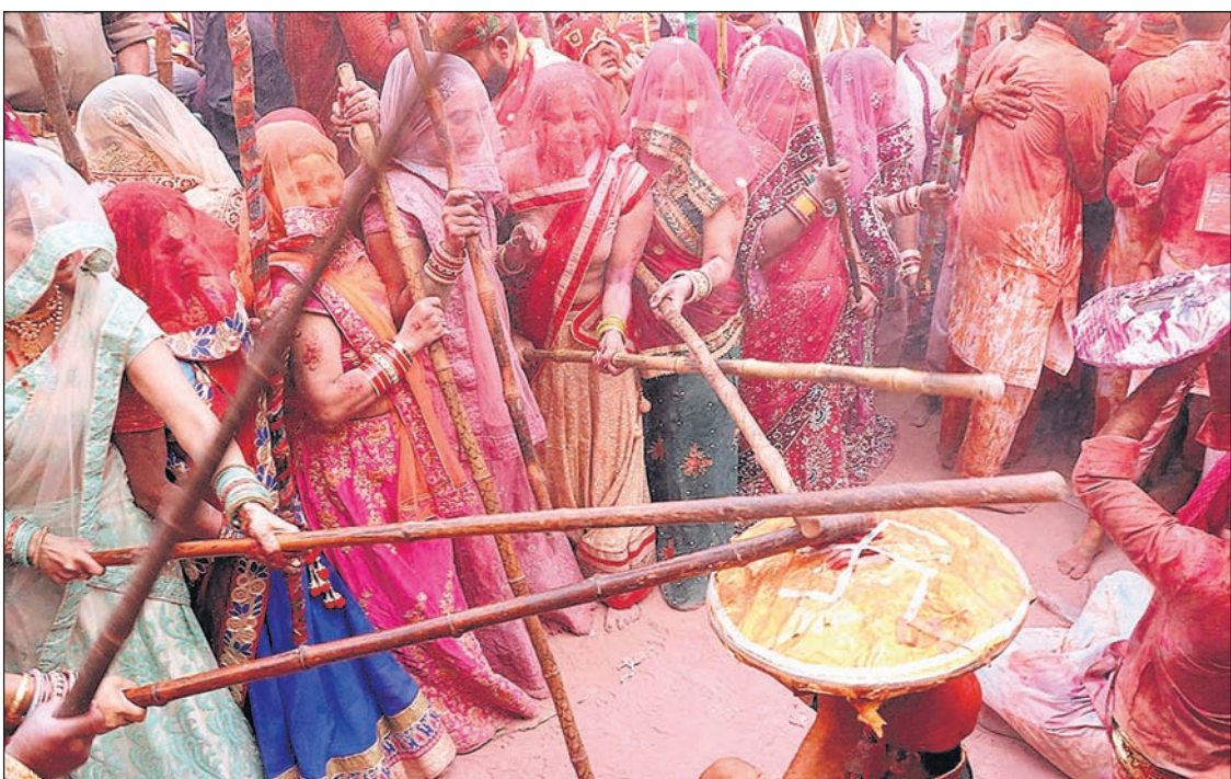
Women of Barsana beating men of Nandgaon with sticks during Lathmar Holi celebration in Barsana town near mathura on Tuesday