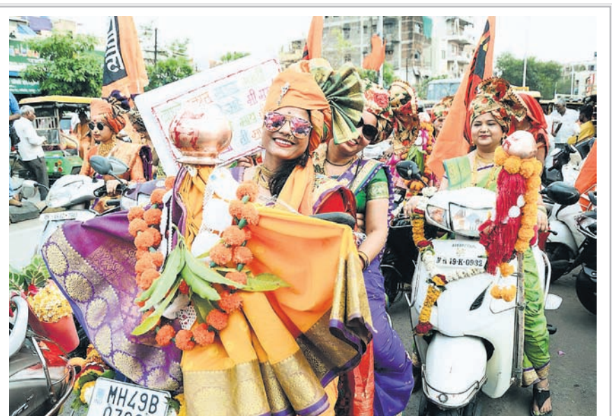
Women in traditional costumes take out a scooter rally on the eve of 'Gudi Padwa' in Nagpur on Tuesday, March 21, 2023

The bench, also comprising justice P.S. Narasimha, asked the Centre's counsel, whether she is ready to argue on the aspect of referring the matter to a constitution bench. The counsel replied that the Attorney General R. Venkataramani, who was not present in the courtroom during the hearing, would have to argue whether a reference should be made to the constitution bench or not. After hearing submissions, the top court scheduled the matter for hearing on April 11, to examine whether petitions should be referred to a constitution bench.