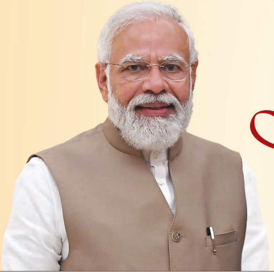
नरेन्द्र मोदी, प्रधानमंत्री