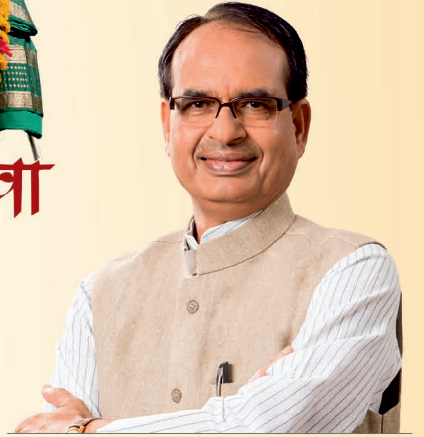
शिवराज सिंह चौहान, मुख्यमंत्री

नूतन वर्षारंभ और चैत्र नवरात्रि का यह पावन अवसर सभी के जीवन में सुख, समृद्धि और प्रसन्नता लेकर आये और हमारा मध्यप्रदेश नित नए प्रगति के शिखरों को छुए, यही मेरी कामना है।