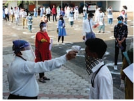
reported after testing 436 Covid samples in a span of 24 hours.

As many as four new Covid-19 cases were recorded in Madhya Pradesh, of which three were reported in Indore and one in Jabalpur district, according to a bulletin issued by the state health department.