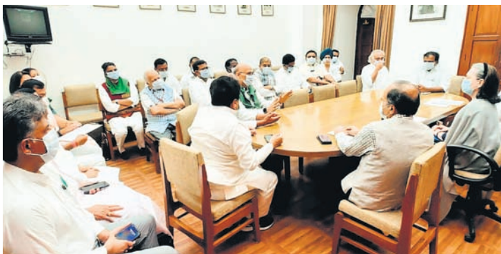
Team Absolute | New Delhi

As many as 16 opposition parties on Monday attended the meeting convened by Leader of Opposition Mallikarjun Kharge at his chamber in Parliament building to devise a strategy ahead of the second part of the budget session on Monday. "Misuse" of central agencies against political leaders, MSP guarantee, inflation are some of the issues the opposition parties will be raising jointly in both the Houses. The opposition MPs in Lok Sabha have moved adjourn-