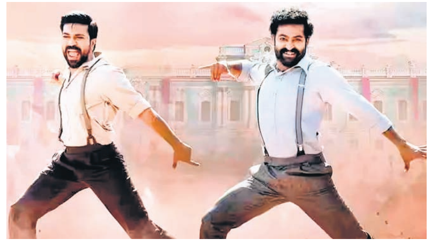
LOS ANGELES

'Naatu Naatu' picturised on Ram Charan and NTR Jr from the film 'RRR' made India proud again as it won the Best Original Song at the 95th Academy Awards.