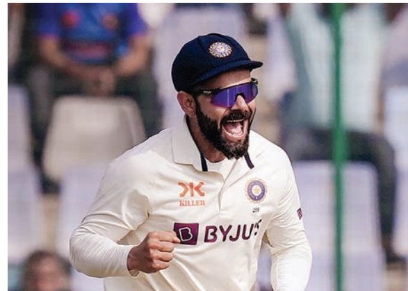
three ICC tournaments already I was."

"You play to win tournaments, but a lot was made of it, to be honest. I captained in the Champions Trophy 2017, I captained the 2019 World Cup, I captained Test Championship 2021, so after