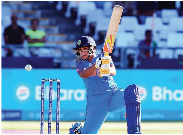
three from Australia, who dominate the shortlist, two players each from