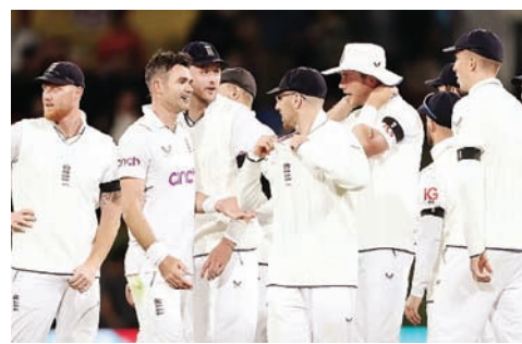
Root in slips.

New Zealand was reduced to 21/31 in the ninth over. They were soon down to 60/4 when Tom Latham (35) was sent back by Jack Leach. Latham attempted a reverse sweep off the left-arm spinner but the ball came off the glove and popped to Joe