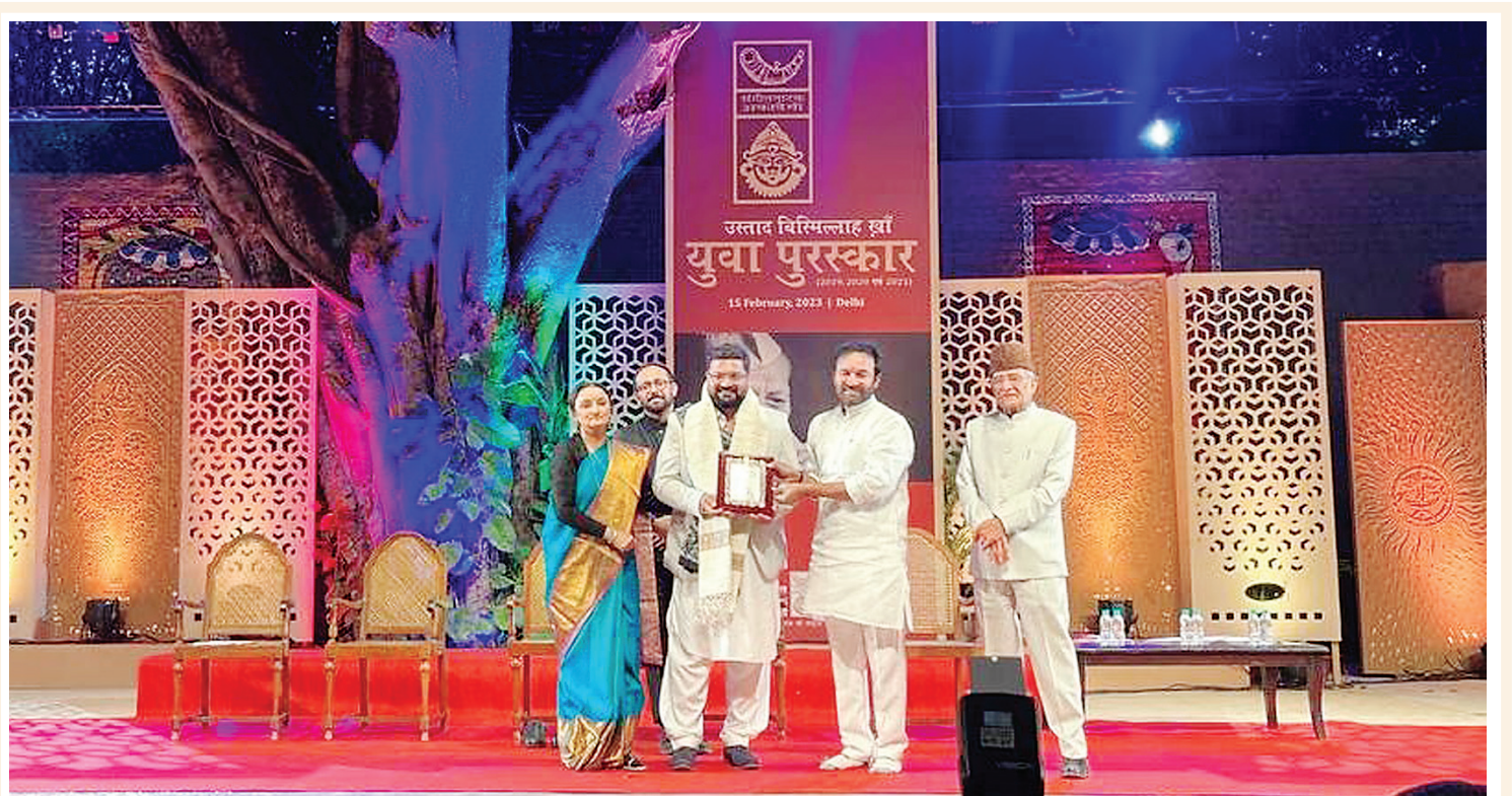
Artist Sarfaraz Haasan honored with the National Youth Award by the Union Minister of Culture and Tourism, Government of India, J.Kishan Reddy at a prestigious function organized at Meghdoot Auditorium, Delhi.

exhumed from grave and subsequent autopsy revealed multiple fractures on top of cervical spine. All 3 accused, the woman and her uncle-aunt, were arrested and booked for murder," police said.