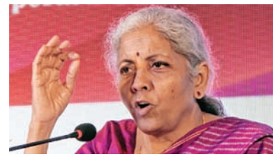
PHDCCI, she said that if the states

Finance Minister Nirmala Sitharaman on Wednesday said that if states arrive at a consensus, then petroleum products can be brought under the GST regime. Addressing a post-budget interactive session organised by industry body