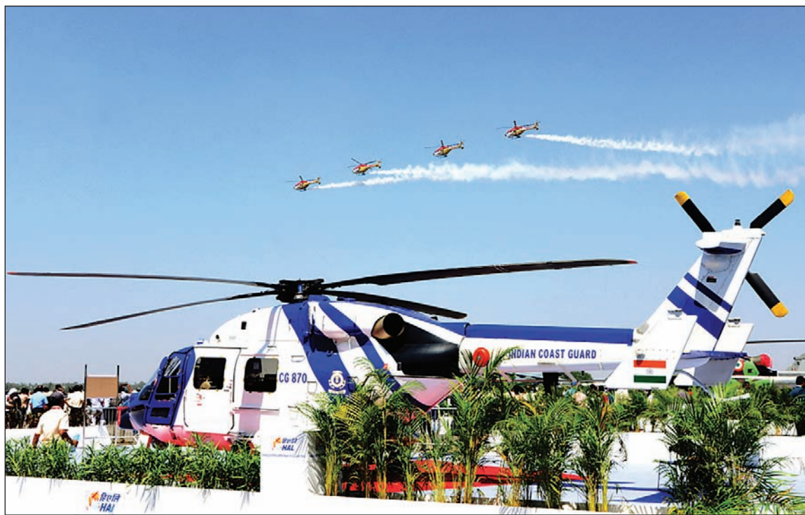
IAF Sarang helicopter aerobatics team performs during the 3rd day of Aero India 2023 at Yelahanka Air Base in Bengaluru on Wednesday, February 15.