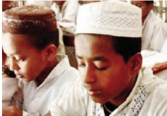
In the first category, the madrasas with strength of 100 to 200 students, while in the second category madrasas having

Madrasas have to be categorised in three categories.