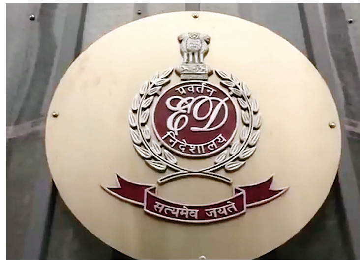
estate and food chain. He is also an owner of a popular dhaba in Kolkata. It is learnt that the team conduct-

As per the latest report, the ED sleuths have detained the businessman for questioning. Sources said that the said businessman was involved in multiple business activities - the prime of which were real