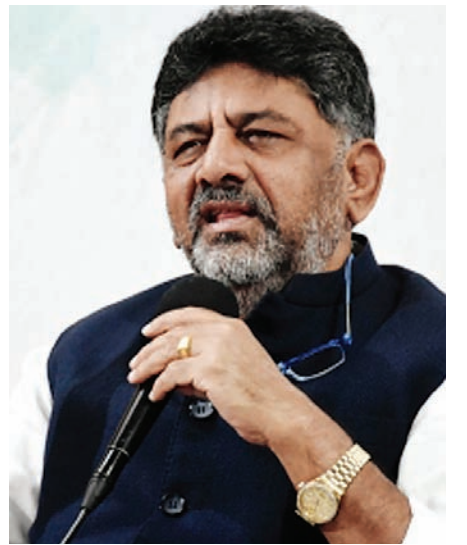
Sources said that Shivakumar's problems may amount as the CBI is likely to file a charge sheet in the disproportionate assets case and the timing may coincide with the polls. The CBI has been conducting investigation in this regard for the past two years. Multiple raids have been conducted on residences of Shivakumar and his relatives.

"The ED has called me for inquiry on February 24. Should I participate in Prajadhvani Yatra in Karnataka or go to ED? ED is existent only for us (opposition). For the ruling party there is no ED and CBI. Let it be, I will certainly know what will happen," he said.