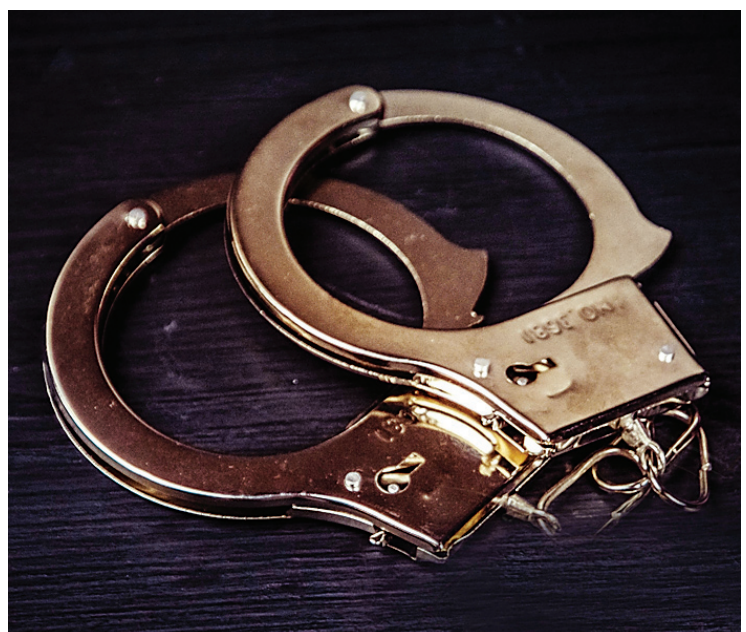
dent of Gautam Colony, Narela.