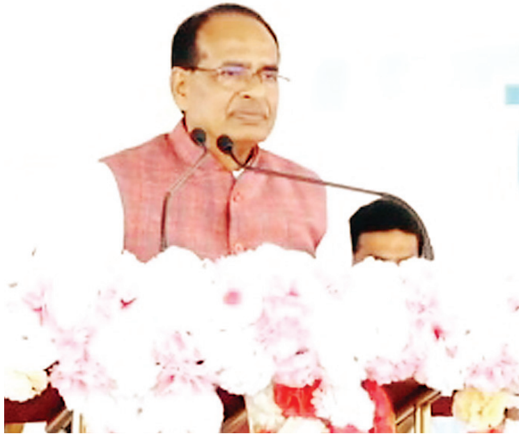
stones of 20,676 proposed development projects were laid across Madhya Pradesh. Meanwhile, the issues of 4.84 lakh people have been

It will conclude on February 25. "Our Vikas Yatra is continuously fulfilling the goals of public welfare, and presenting the development picture of Madhya Pradesh. So far, as many as 27,421 projects, which were completed have been inaugurated and handed over to the people. At the same time, foundation