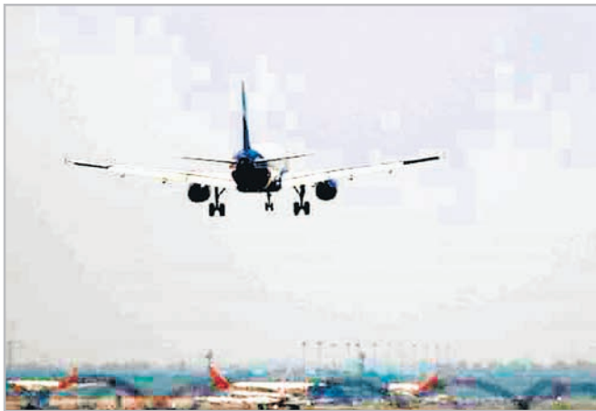
Indira Gandhi International (IGI) Airport.

Residents of Delhi woke up to cold morning on Saturday with the minimum temperature plunging to 2 degrees Celsius, while dense fog delayed flights at the