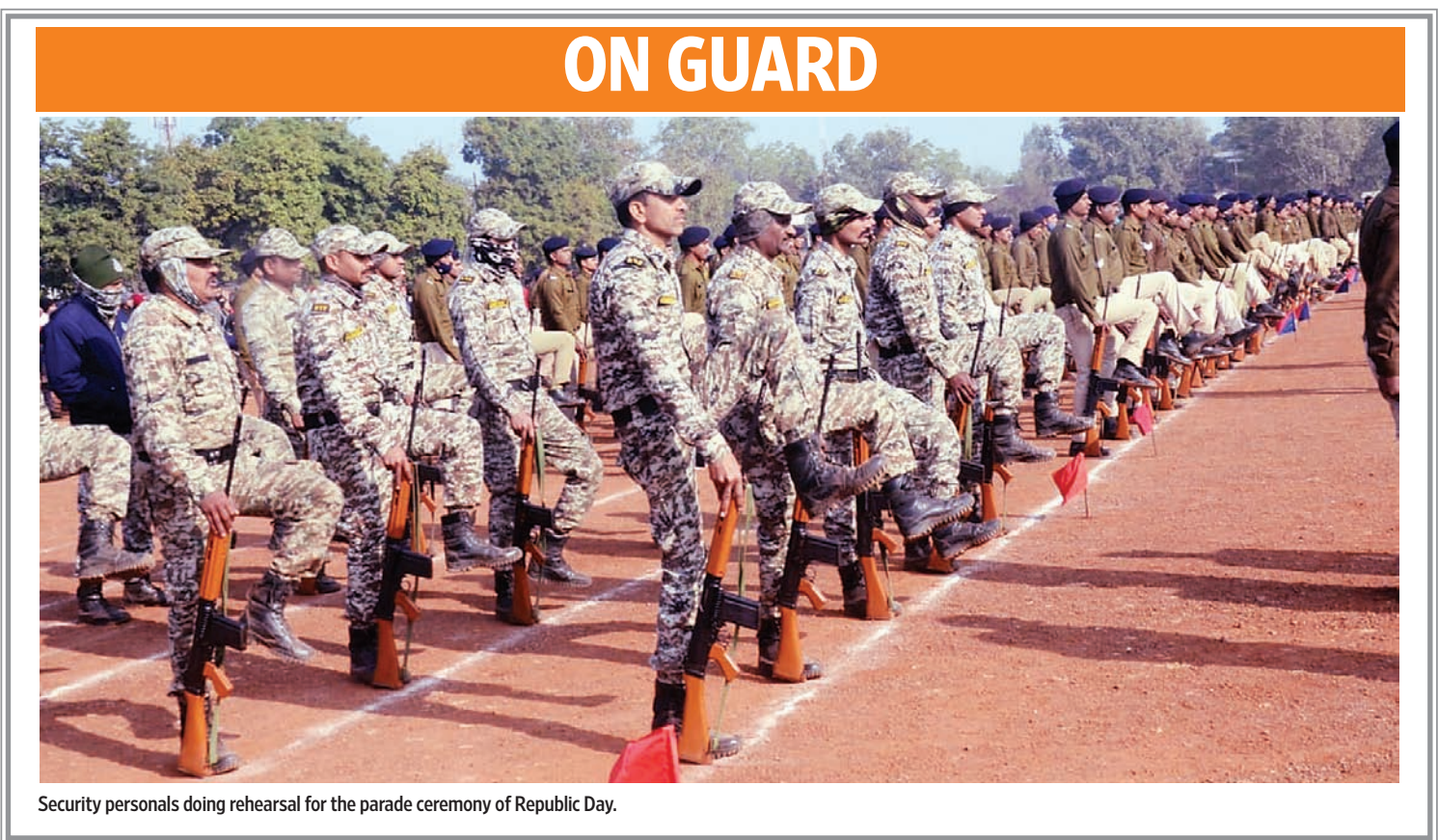
Security personals doing rehearsal for the parade ceremony of Republic Day.

vant FIR. The evidence and statements collected are geo-tagged and time-stamped, so they cannot be tampered with later. This has also increased the confidence of the courts in the police investigation.