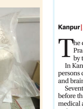
New Delhi: Customs authorities at Mumbai's Chhatrapati Shivaji Maharaj International Airport have seized cocaine and heroin amounting to more than Rs 32 crore in two separate cases, an official said on Friday. The Customs official said the 4.47 kg heroin worth Rs 31.29 crore in the covers of a document folder, while 1.596 kg of cocaine valued at Rs 15.96 crore was hidden in the buttons of clothes. "We launched a drive against drugs smuggling and busted this racket," said the official. The accused were found violating provisions of Section 8 of the NDPS Act, and had committed an offence punishable under Section 21, Section 23 and Section 29 of NDPS Act. Accordingly, they were placed under arrest, the official said, adding that the narcotic substances were seized along with concealing material under Section 43(a) of the NDPS Act. Further probe is underway.

The cold wave in Uttar Pradesh is turning deadlier by the day. In Kanpur, on Thursday, 25 persons died due to heart attack and brain stroke. Seventeen of these died even before they could be given any medical aid. According to doctors, the sudden increase in blood pressure in the cold and blood clotting is causing heart attack and brain attack. According to the control room of the Cardiology Institute, 723 heart patients came to the emergency and OPD on Thursday. Of these, 41 patients who were in critical condition, were admitted. Seven heart patients undergoing treatment at the hospital in critical condition died due to cold. Apart from this, 15 patients were brought to emergency in a brought dead condition. Professor Vinay Krishna, director of cardiology, said that patients should be protected from cold in this weather. A faculty member in the King George's Medical University