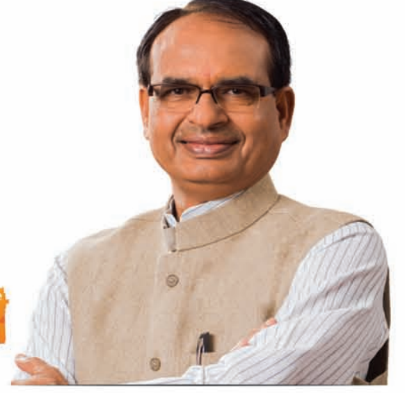
शिवराज सिंह चौहान मुख्यमंत्री, मध्य प्रदेश