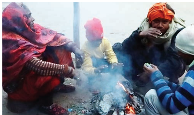
(KGMU) in Lucknow said, "Heart attacks in this cold weather are not restricted only to the elderly. We have cases when even teenagers have suffered heart attacks. Everyone, irrespective of age, should keep warm and stay indoors as much as possible." Meanwhile, Residents of Delhi woke up to cold morning on Friday with the minimum temperature recorded at 4 degrees Celsius, while the India Meteorological Department (IMD) has warned that cold wave conditions are likely to remain for another 24 hours in

The cold wave in Uttar Pradesh is turning deadlier by the day. In Kanpur, on Thursday, 25 persons died due to heart attack and brain stroke. Seventeen of these died even before they could be given any medical aid. According to doctors, the sudden increase in blood pressure in the cold and blood clotting is causing heart attack and brain attack. According to the control room of the Cardiology Institute, 723 heart patients came to the emergency and OPD on Thursday. Of these, 41 patients who were in critical condition, were admitted. Seven heart patients undergoing treatment at the hospital in critical condition died due to cold. Apart from this, 15 patients were brought to emergency in a brought dead condition. Professor Vinay Krishna, director of cardiology, said that patients should be protected from cold in this weather. A faculty member in the King George's Medical University