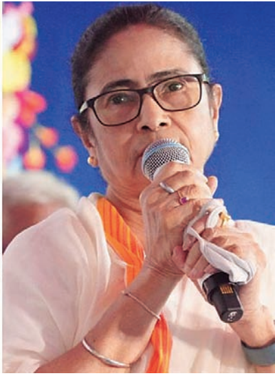
ers immediately jumped in for damage control. "Such comments are confusing