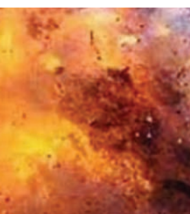
Grand in the Krishna Nagar area was so strong that shards of glass were seen strewn on the road. Fire tenders were rushed to douse the flames. Officials said that the cause of fire would be investigated.

Ten people have been seriously injured in a gas pipe line explosion at a hotel in Lucknow. The injured have been admitted to a nearby hospital. Sources said that the explosion in Hotel Emperio