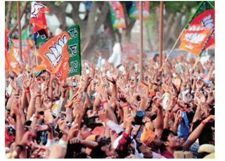
State BJP sources said already they have received the green signals from the party's state leadership that top leaders including Prime Minister Narendra Modi, Union Home Minister Amit Shah and the party's national president J.P. Nadda will be visiting the states in the next few months. "Attempts are on to bring Uttar Pradesh Chief Minister Yogi Adityanath to the state. So we want to convert those occasions into mega events through these Rath Yatras," said a state BJP leader who did not wish to be named.

West Bengal BJP is planning to organise six separate 'Rath Yatras' in the state this year keeping in mind the elections for the three-tier panchayat system as well as the 2024 Lok Sabha polls. Although, top state BJP leaders are unwilling to divulge the details of the plan, sources from the state committee of the party said that this six different 'Rath Yatras' are aimed at covering the entire state starting from the hills in North Bengal to the mangrove forests of Sunderbans in South Bengal. Sources said that the six yatras will be 'Darjeeling Rath' covering north Bengal districts of Cooch Behar, Darjeeling, Jalpaiguri and Alipurduar districts, 'Gaurbang Rath' covering parts of Malda, South Dinajpur and North Dinajpur districts, 'Nabadwip Rath' covering parts of Murshidabad, Nadia and North 24 Parganas districts, 'Rarbang Rath' covering Birbhum, Bankura, Purulia, West Midnapore and Hooghly district, 'Sunderbans Rath' covering South 24 Parganas district and finally 'Kolkata Rath' covering the entire state capital.