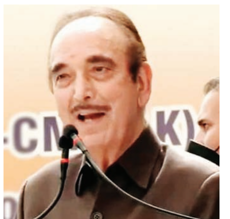
On December 30, the former Jammu and Kashmir Chief Minister Ghulam Nabi Azad rejected the reports about his rejoining the Congress as "completely baseless" and alleged this was to demoralise his party workers. Expressing "shock" at the reports in a section of media in this regard, Azad, in a tweet, said: "... Unfortunately such stories are being planted by a section of leaders in the congress party right now and are doing this just to demoralise my leaders and supporters. "I don't have any ill will against congress party and its leadership, however I request them to tell these habitual story planters to refrain from doing so."