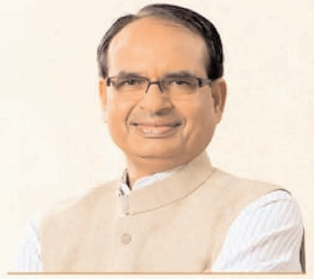
शिवराज सिंह चौहान, मुख्यमंत्री, मध्यप्रदेश