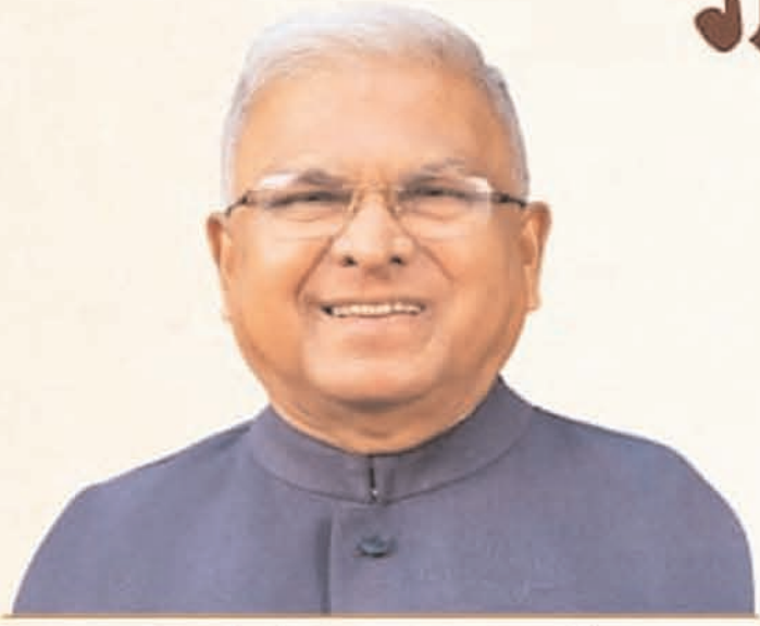
मंगुभाई पटेल, राज्यपाल, मध्यप्रदेश