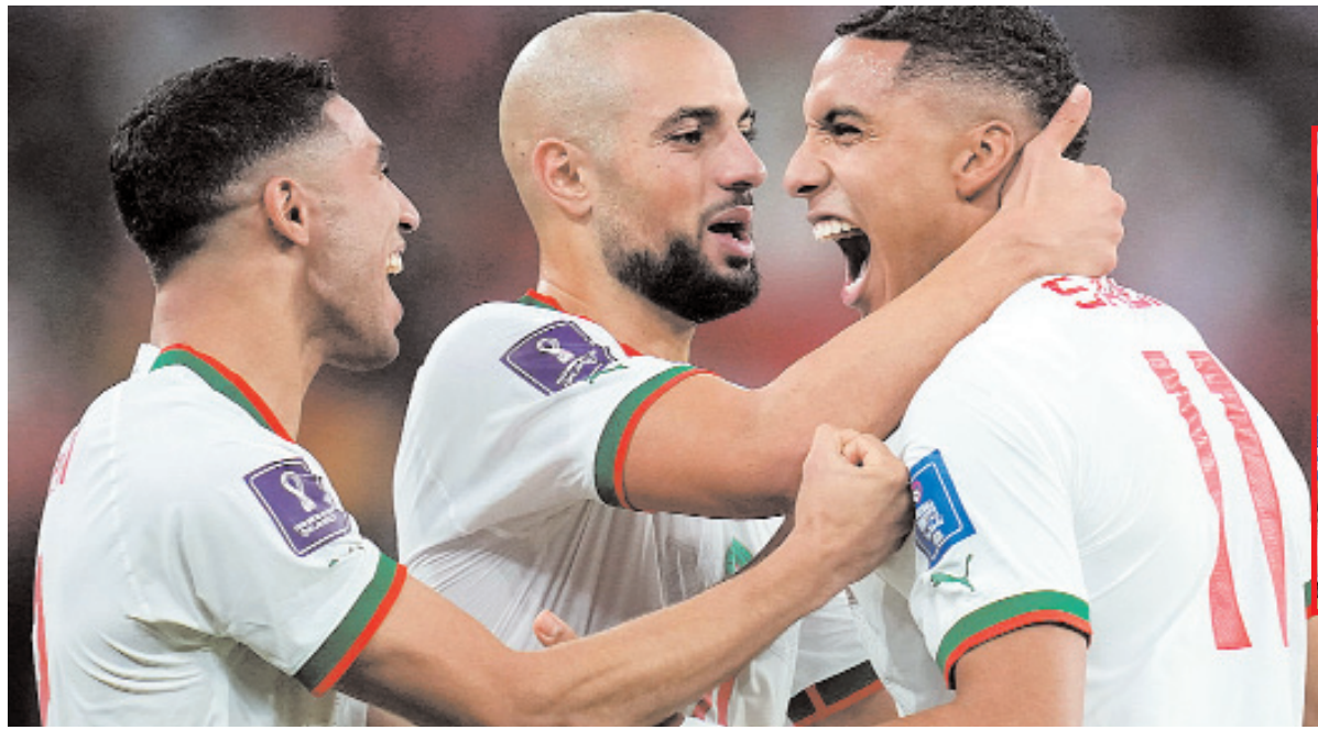
Doha

Morocco were denied a goal on the stroke of half-time for offside when Hakim Ziyech's free kick ended up in the back of the net, and they went into the break locked at 0-0 with Belgium in their World Cup Group F fixture at Al Thumama Stadium on Sunday. Belgium had the better chance up to that point, after Morocco made a mystery change of goalkeeper minutes before kick-off when they replaced Yassine Bounou with Munir El Kajoji, who made a smart early save to deny Belgium forward Michy Batshuayi.