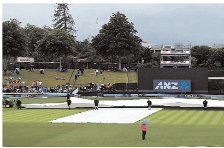
Hamilton | Agencies

Rain had the final say as a spot-start second ODI between India and New Zealand in Seddon Park was abandoned due to rain on Sunday. There were some predictions of rain threatening to disrupt the proceedings, but it washed off the match.