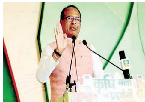
Chief Minister said that while on the one hand Prime Minister Shri Modi gives Rs 6000 to small

Chief Minister Shivraj Singh Chouhan has said that for the fulfillment of Prime Minister Narendra Modi's resolve to double the income of farmers, production will also have to be increased and the cost will have to be reduced. In this direction, while the Madhya Pradesh government is continuously increasing the area under irrigation, on the other hand, loans are being provided to the farmers at zero percent interest. Today's Krishi Mela will prove to be lucky for the farmers. Chief Minister Chouhan was addressing the inauguration programme of three-day 'Krishi Mela and Exhibition' in Morena district.