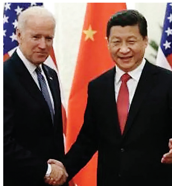
ing for competition, not conflict". The President also said he

Washington | Agencies In an address to the media, US President Joe Biden has confirmed that he will meet his Chinese counterpart Xi Jinping on November 14 in Bali during which Taiwan is expected to top the agenda. The meeting in Bali on the sidelines of the G20 summit will be the first between the two leaders since Biden took office in January 2021, according to the White House. When asked at the press briefing if he was committed to defending Taiwan militarily and willing to make any concessions, Biden said: "I'm not willing to make any fundamental concessions." Referring to when he was Vice President in the former Barack Obama administration, Biden said that he "met with him (Xi) many times.... And I've told him: I'm look-