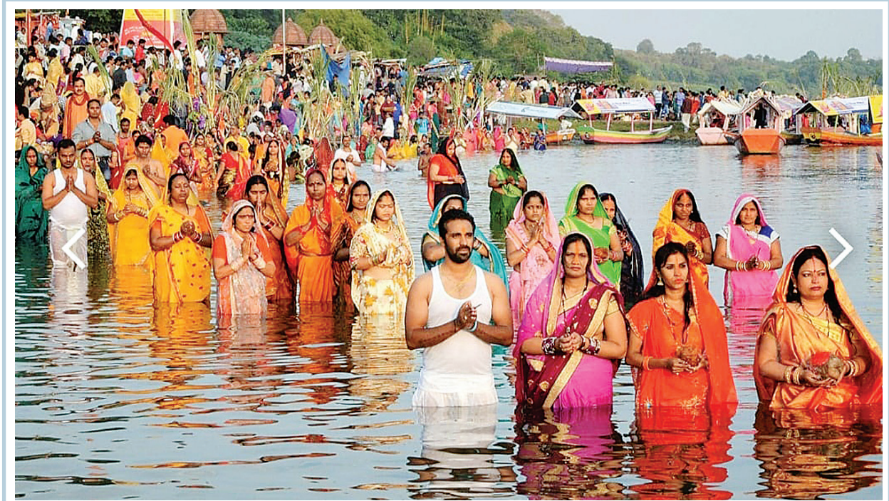
The Chhath festival was celebrated with zest & zeal in entire Madhya Pradesh including Bhopal. After two years of the Corona period, Chhath Puja was celebrated in many places in the city. Sun God is worshiped with prayers and religious rituals, and is considered to be one of the most eco-friendly festival. Chhath Puja lasts for 4 days

were shifted to the MYH for treatment, nine have succumbed to the injuries so far.