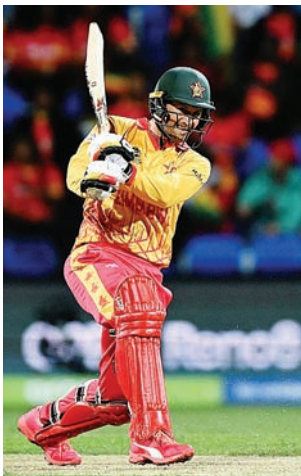
Zimbabwe and then coming to