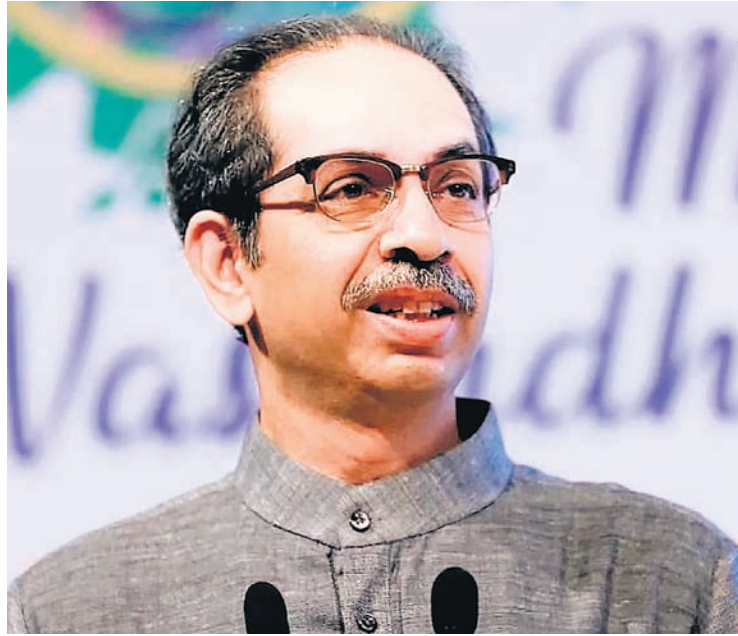
held in Shegaon. The BJT will traverse a total of nearly 382 kms in the five districts in 13 days before entering Madhya Pradesh on the next leg on November 20. Top central and state Congress leaders like President Nana Patole, Balasaheb Thorat, Ashok Chavan, Manikrao Thakre, Naseem Khan, and many more are engaged in the meticulous planning and engagements of Gandhi during the BJT in the five districts, where he will directly interact with the local people. The three parties - which were part of the Maha Vikas Aghadi (MVA) government for two-and-half years before it collapsed on June 30 - will now come together for the first time through the BJT. Besides the Congress, NCP and Sena-UBT leaders, the BJT will also see the participation of many other political and farmers groups, prominent individuals from different walks of life, social and non-political entities which will join and march together with Gandhi at various locations during the state sojourn.

The BJT with Gandhi leading the march on foot with many senior leaders, is slated to enter Maharashtra on November 7 and the party has organ-