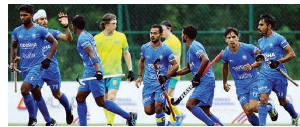
Johor (Malaysia)

I ndian Junior Men's Hockey Team played out a thrilling 5-5 draw against Australia at the 10th Sultan of Johor Cup here on Wednesday.