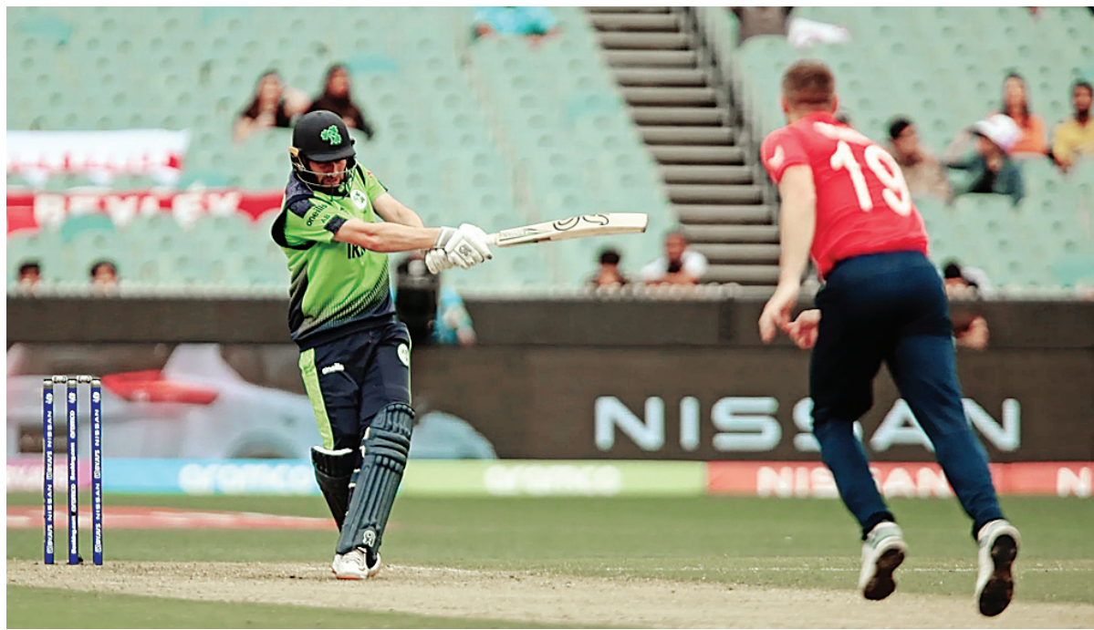
Melbourne | Agencies

A dominant Ireland sprung a huge upset in the ongoing T20 World Cup with a five-wicket victory over 2010 champions England by five runs via DLS method in a Group 1 match in Super 12 stage at the iconic Melbourne Cricket Ground (MCG) on Wednesday. Wednesday's win is also just the third victory for Ireland over England in men's international cricket after ODI wins in Bengaluru 2011 (in the World Cup) and Southampton 2020 and also their first