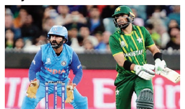
Perth

P akistan top-order batter Iftikhar Ahmed has indicated his side is yet to come to terms with the last-ball defeat to arch-rivals India in their ICC T20 World Cup Super-12 match at the packed Melbourne Cricket Ground (MCG) on October 23, saying that's "not an easy defeat to digest".