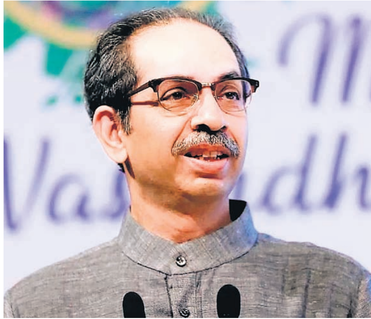
held in Shegaon. The BGY will traverse a total of nearly 382 kms in the five districts in 13 days before entering Madhya Pradesh on the next leg on November 20. Top central and state Congress leaders like President Nana Patole, Balasaheb Thorat, Ashok Chavan, Manikrao Thakre, Naseem Khan, and many more are engaged in the meticulous planning and engagements of Gandhi during the BGY in the five districts, where he will directly interact with the local people. The three parties - which were part of the Maha Vikas Aghadi (MVA) government for two-and-half years before it collapsed on June 30 - will now come together for the first time through the BGY. Besides the Congress, NCP and Sena-UBT leaders, the BGY will also see the participation of many other political and farmers groups, prominent individuals from different walks of life, social and non-political entities which will join and march together with Gandhi at various locations during the state sojourn.

The BGY with Gandhi leading the march on foot with many senior leaders, is slated to enter Maharashtra on November 7 and the party has organ-